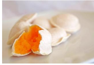
Tradicional pastry Ovos Moles - Aveiro