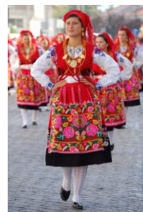
Portuguese Traditional costume