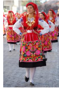
Portuguese Traditional costume