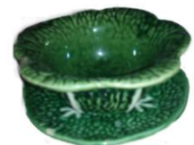
Rafael Bordalo Pinheiro Portuguese ceramist