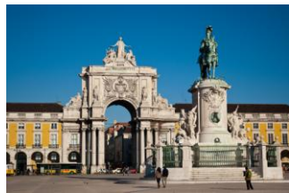
Lisbon, Capital of Portugal