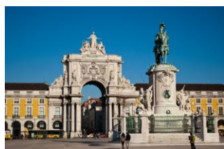
Lisbon, Capital of Portugal