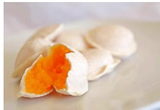
Tradicional pastry Ovos Moles - Aveiro