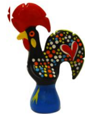
Galo de Barcelos Icon of Portuguese folklore culture