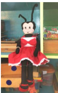
Portuguese Mascot Carochinha