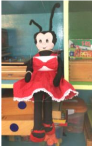
Portuguese Mascot Carochinha