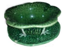
Rafael Bordalo Pinheiro Portuguese ceramist