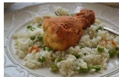
POHANO MESO I RIZIBIZI – fried meat and rice with carrot and peas