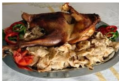
PURICA S MLINCIMA – turkey with some kind of homemade pasta