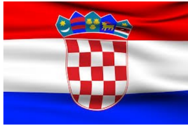
Hrvatska zastava – Croatian flag