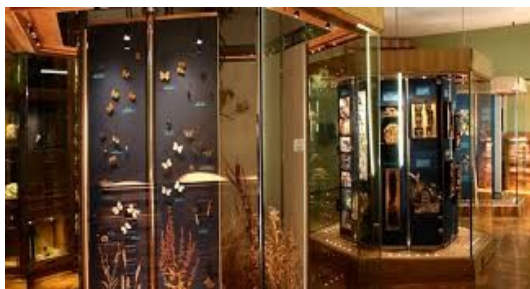
The „World of insects“ etnomological collection