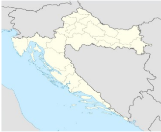
Mapa Hrvatske – Map of Croatia

Ja sam.... Kako se ti zoveš? I'm.... What's your name?