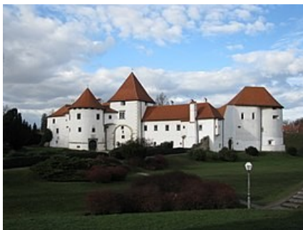
The Old Town Varaždin