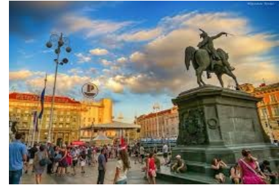
Glavni grad – Capital city ZAGREB