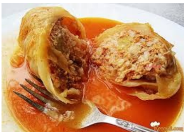
SARMA – meat balls in cabbage