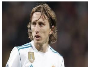
Luka Modrić footballer