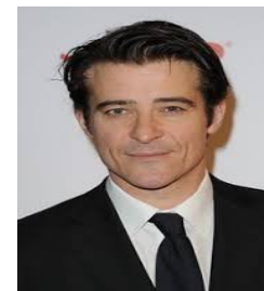
Goran Višnjić Hollywood actor