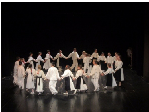
The anniversary of the school