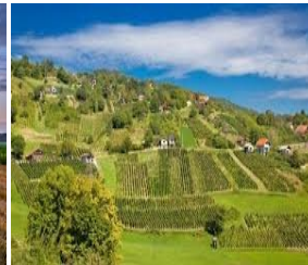
Hrvatsko zagorje hills