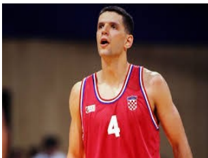
Dražen Petrović (1964.-1993.) NBA player