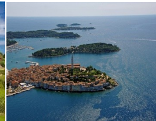
Jadransko more i obala Adriatic sea and coast