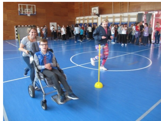
Family day – sports competition