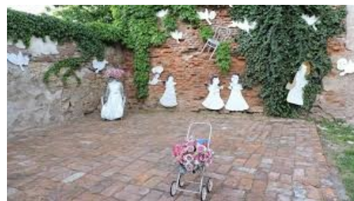
The Museum of Angels