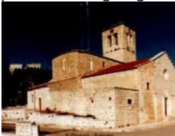
3. St George church