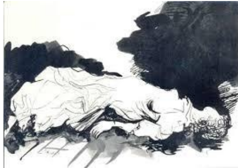
1. Delicata dead

The following day she was buried in Saint George’s Church.