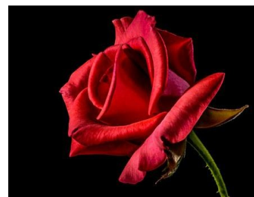
2. Red rose

They wanted to kiss each other, but Delicata gathered a few flowers from some vases on her balcony to throw them to him. Just then Mr Civerra saw the horse , saw Alfonso , and he rushed upstairs to his daughter who was throwing the flowers to her beloved. He was so furious and shouted: “Delicataaaa...Delicataaaa!!! You are