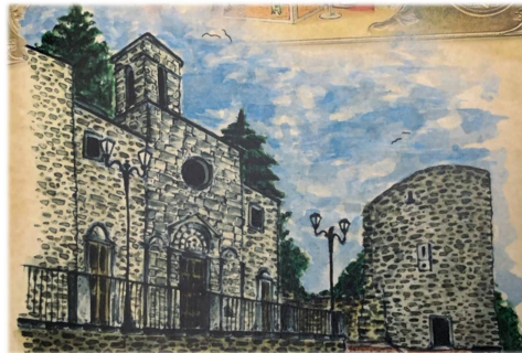
St Bartolomeo church