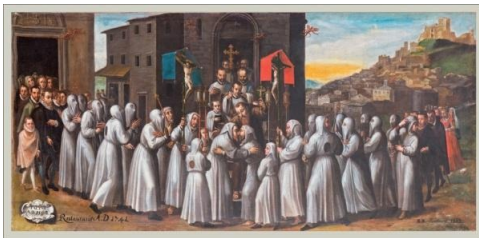
4. Crusaders and Trinitarians