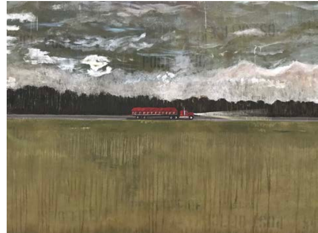
Painting by Peter Doig