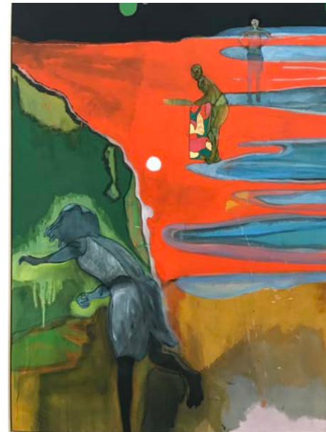
Painting by Peter Doig