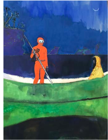
Painting by Peter Doig