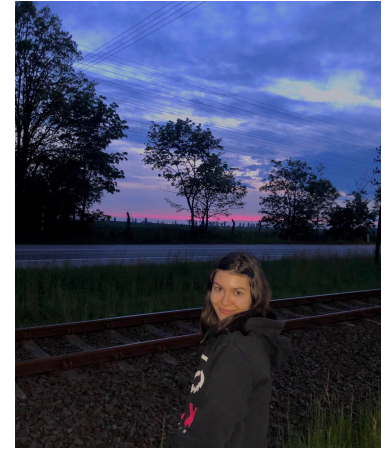
hanging out around the neighbourhood