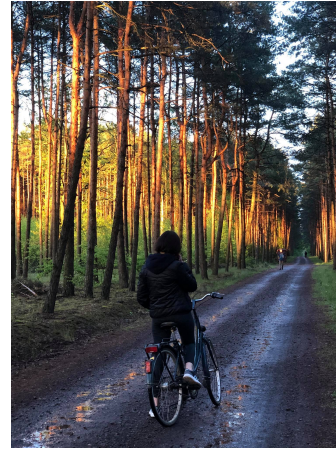
bike trips in the forest