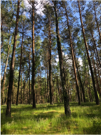
walks in the forest with daddy