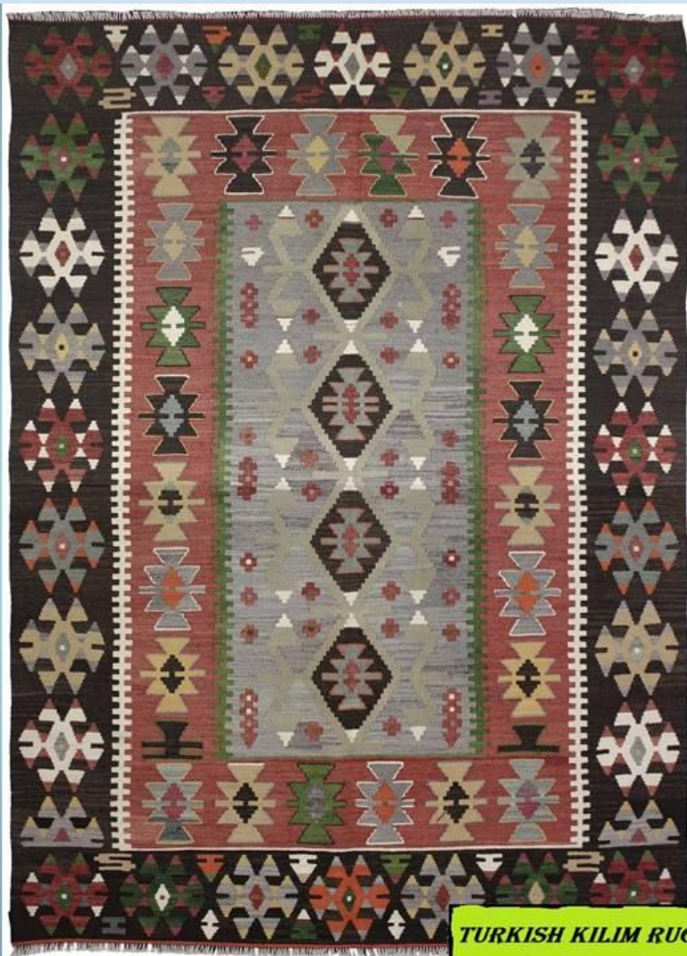
TURKISH KILIM RUG