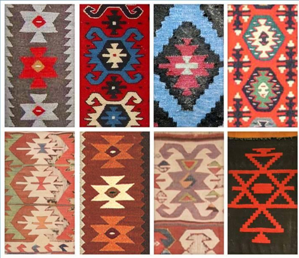
Bulgarian rug ornaments