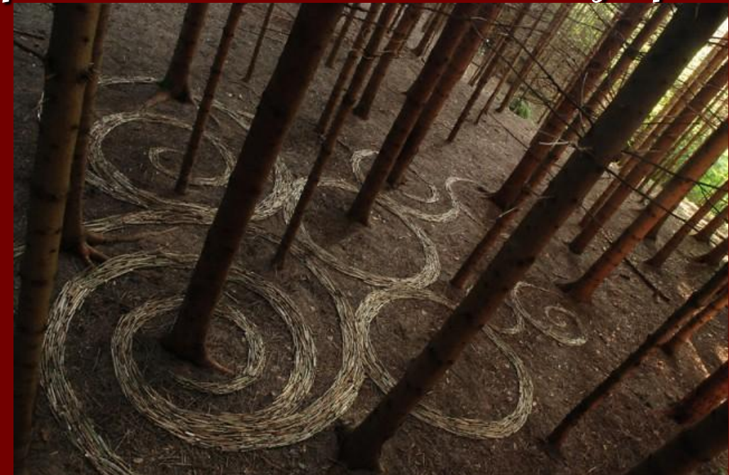
"New Skills New Schools" - ART and CLIL, Cluj-Napoca, 15-19 January 2018

■ Land art is an art movement that emerged in the 1960s and 1970s. As a trend "Land art" expanded boundaries of art by the materials used wich were only provided from the nature and the siting of the works.