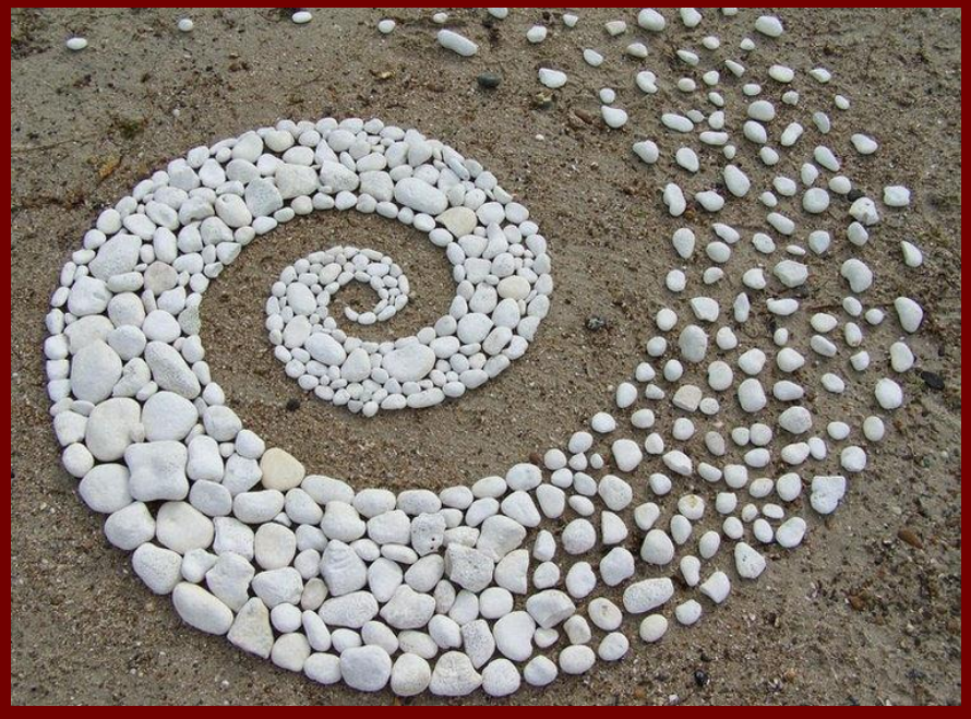
"New Skills New Schools" - ART and CLIL, Cluj-Napoca, 15-19 January 2018