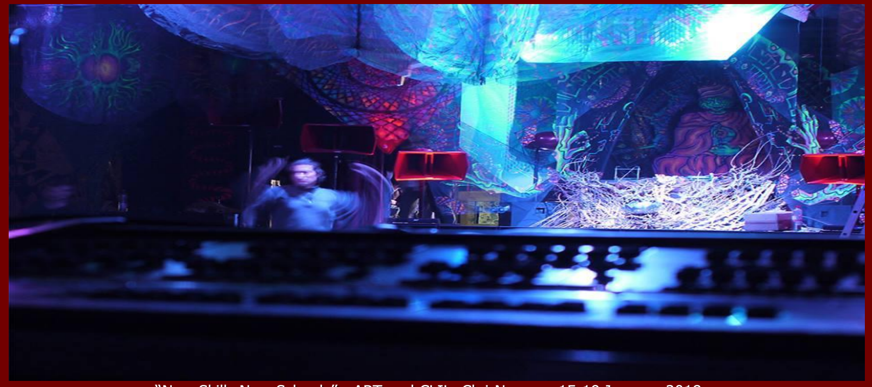
"New Skills New Schools" - ART and CLIL, Cluj-Napoca, 15-19 January 2018

Te Văd("I see you") it's a decoration - art project created from love and desire of enjoying nature, music and souls. Nature is kind and she offers plenty of toys for expressing sentiments and creating every time an unique story space.