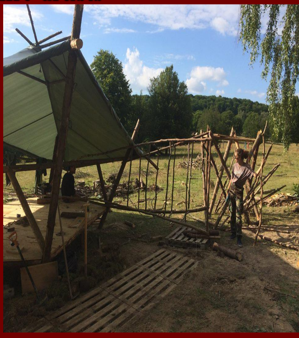
"New Skills New Schools" - ART and CLIL, Cluj-Napoca, 15-19 January 2018