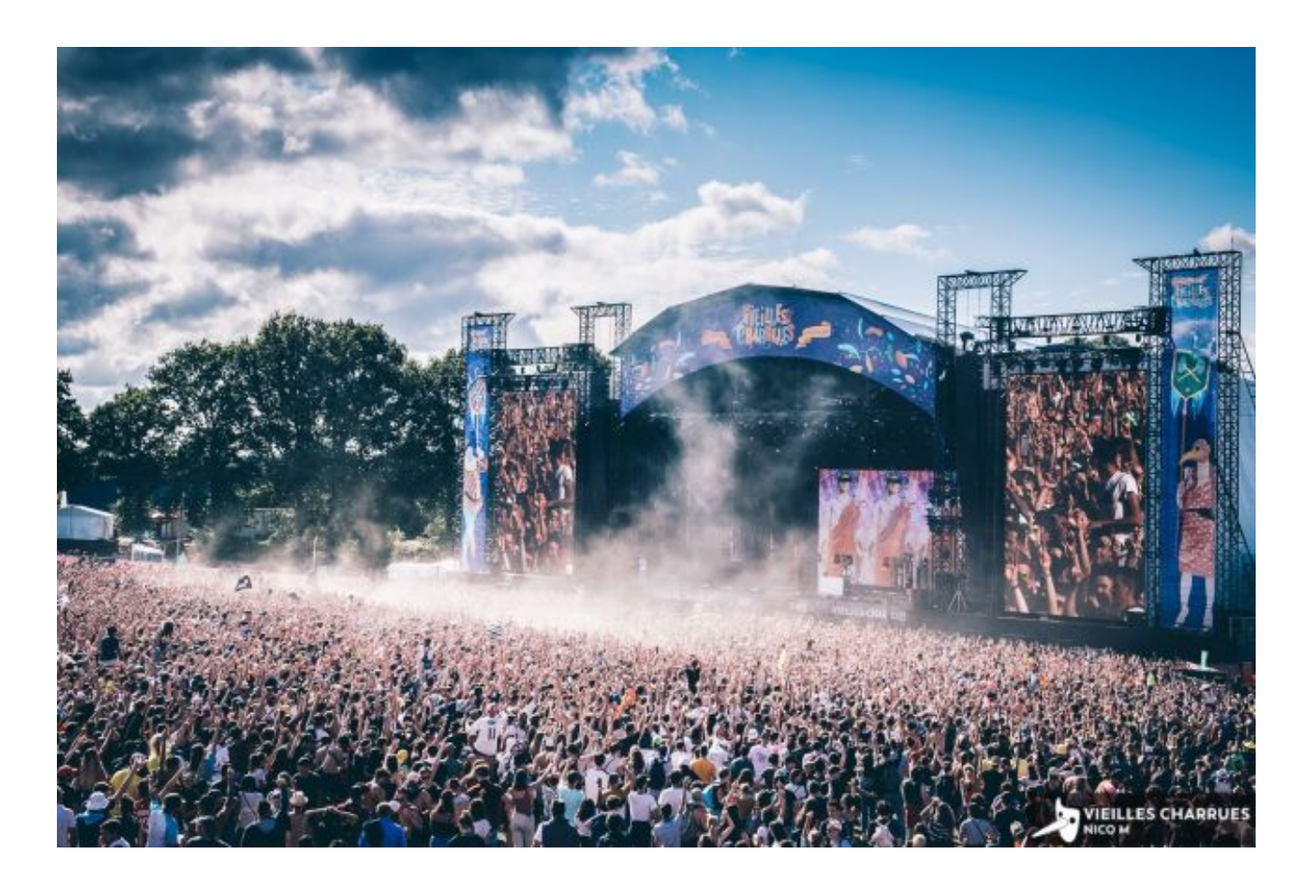
The festival welcome about 30 000 spectators every year over 4 days.