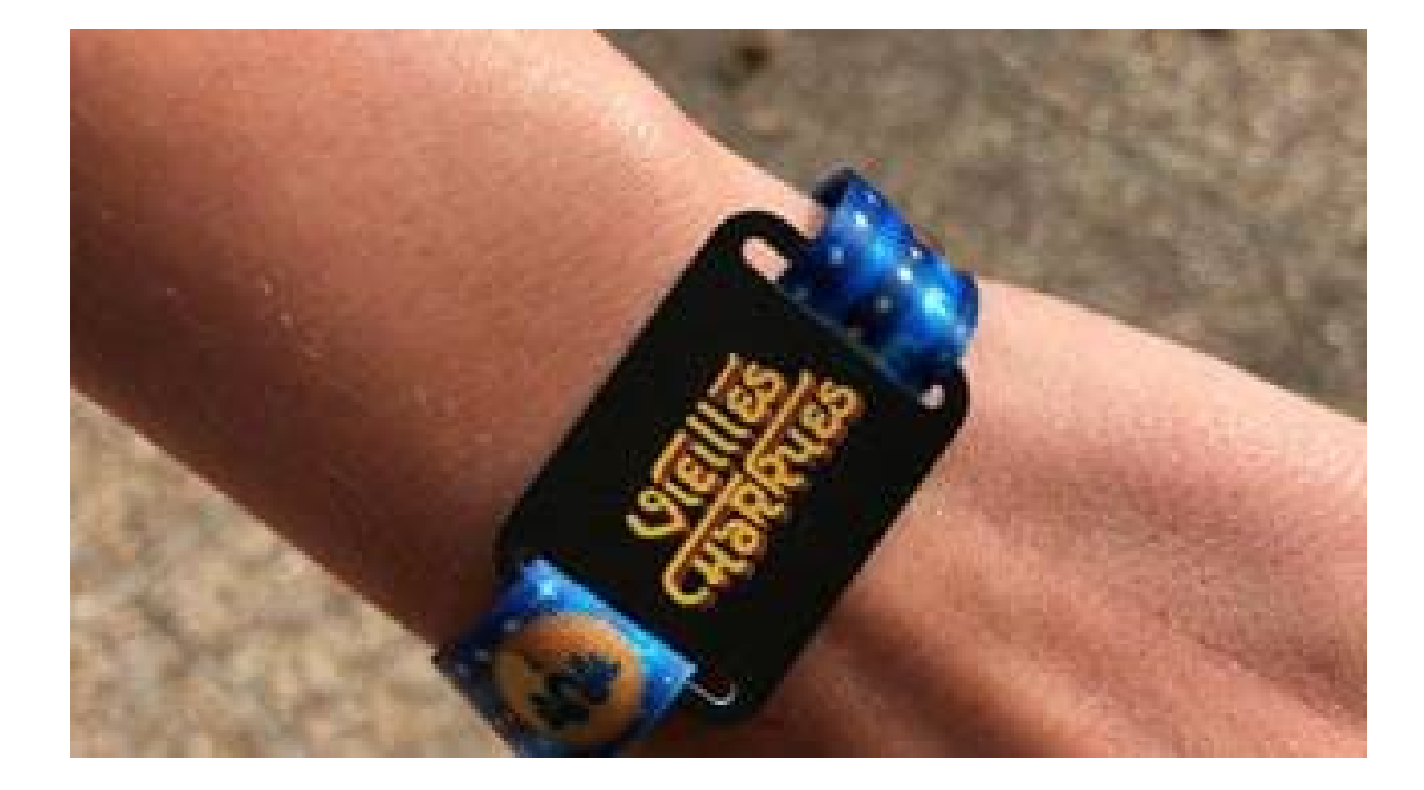
The bracelet called "Moneiz" allows the festivalgoers of the Vielles charrues to have access to the festival and to be able to pay.