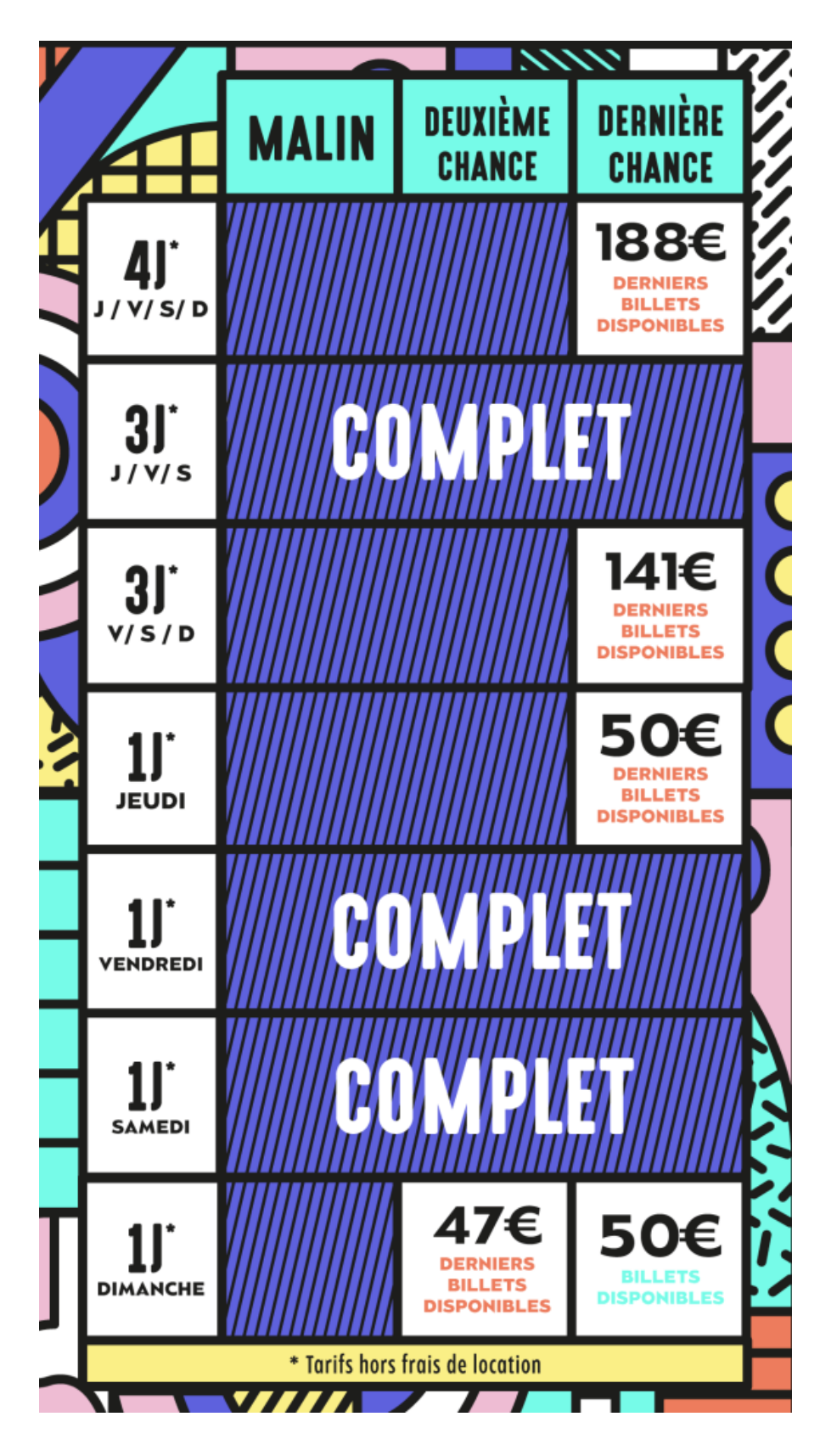
To access the festival, the sale of tickets is available on an online ticket office around May. The prices for a festival day are around 50 euros per person.

The Vieilles Charrues festival, create in 1992 is one of the biggest festival in Europe. That is an associative festival of current music, annual, scheduled over four days on the third weekend of July in the town of Carhaix-Plouguer, in Finistère. The festival is often nicknamed "the Plows", especially on social networks. Singers known as Dj Snake, Bob Sinclar, MC Solar, Indochine, Véronique Sanson, The Cranberries, Diam's ...have already been invited to animate the festival.