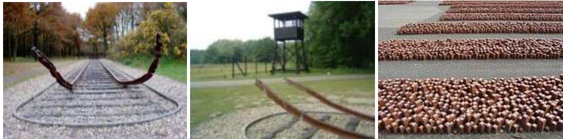
The 102.000 stones monument at Westerbork. Each individual stone represents a single person that stayed at Westerbork and died in a Nazi concentration camp.

Camp Westerbork was a transit camp in Drenthe province, northeastern Netherlands, during World War II. Established by the Dutch government in the summer of 1939, Camp Westerbork was meant to serve as a refugee camp for Jews who had illegally entered the Netherlands.