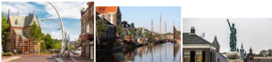
άγαλμα της ελευθερίας

Assen is a municipality and a city in the northeastern Netherlands, and is the capital of the province of Drenthe. It received city rights in 1809. Assen is known for TT Circuit Assen, the motorcycle racing circuit, where on the last Sunday in June the Dutch TT is run; and also for the annual Assen Dance Festival.