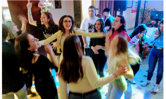
Oujel za mlade i multimediju