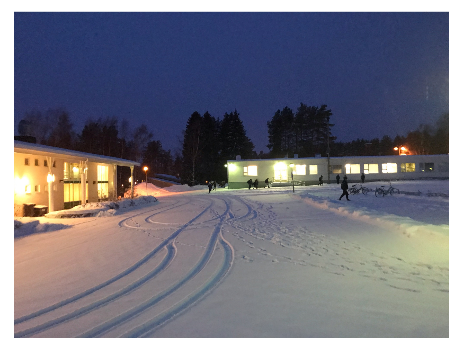
<u>High school in Finland.</u>