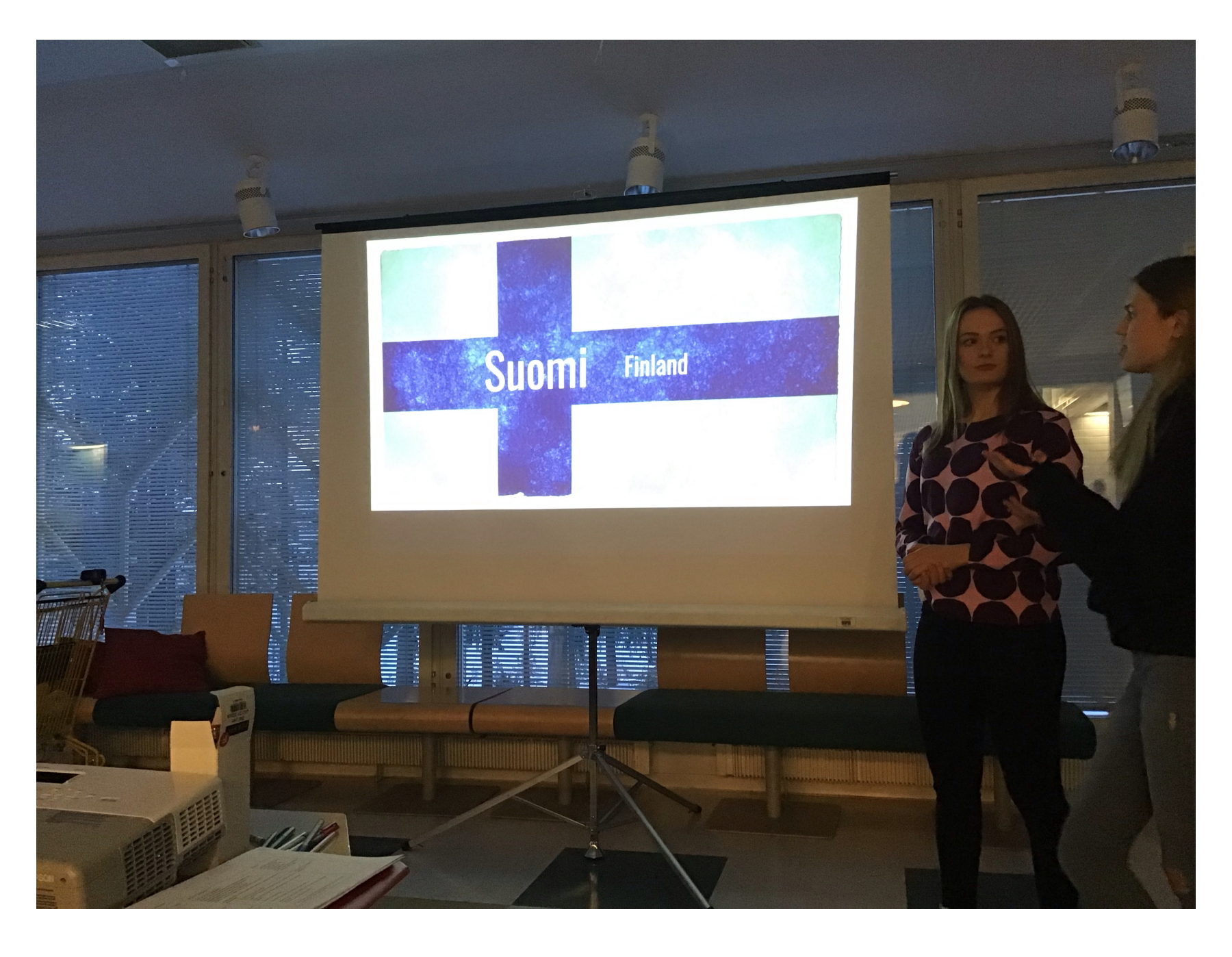
Presentation of Finland.