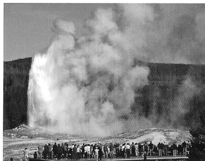
Old Faithful, a geyser in Yellowstone

People also like to visit geysers. Water very far under the ground meets very hot rocks. The water gets hotter and hotter and finally boils. 13 Then it comes out of the ground very fast and flies high into the air as a geyser.