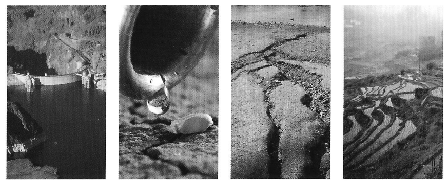
dam drought erosion irrigation

Complete the sentences with the correct words.