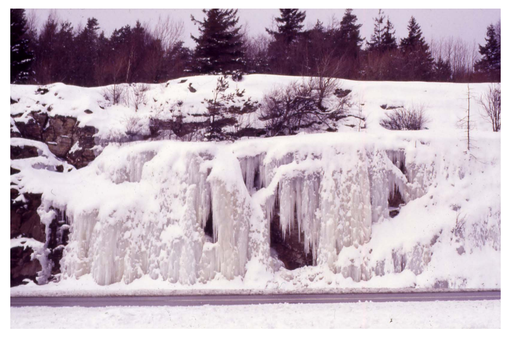
Icicles and snow