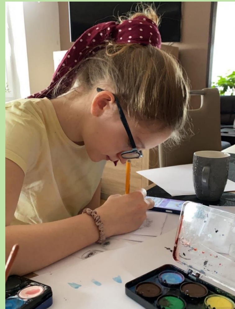
Students making Easter cards 😊