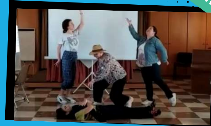
In the count's castle