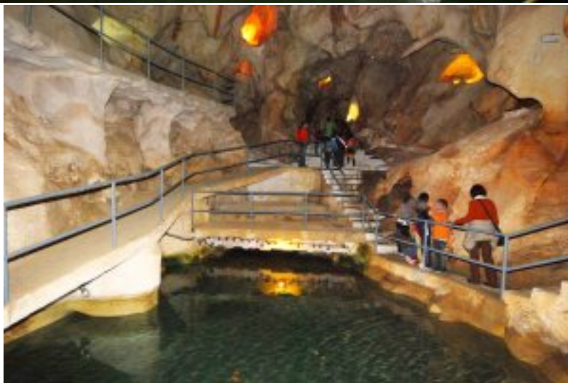
Cuevas del Tesoro, Rincón de la victoria.