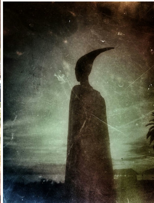
Statue representing Noctiluca, Rincón de la Victoria