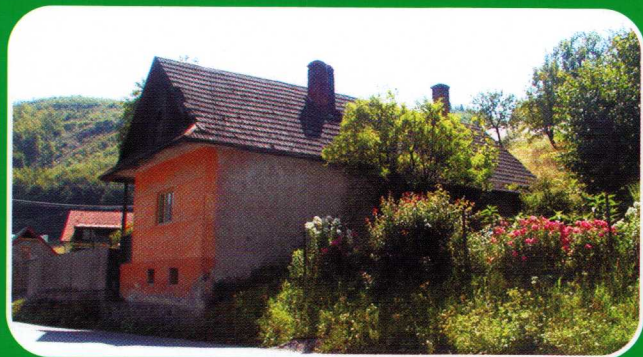
Original glassworker's house

When the original settlement was created, it was called Sklená (glass) Huta. The name Stará Huta is actively mentioned from 4 June 1630, when Štiavnica Chamber made an agreement with Silesian glassmaker Michal Ulbma to build a glass factory in Nová Baňa.