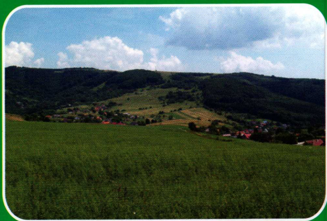
A view of Vojšín

Vojšín at 818,9 m.a.s.l. is the third highest hill of Pohronský Inovec. At the same time it is a very nice viewpoint. On the horizon, from the south-west to the north stretches the Protected Country Area of Pontrie. It includes the mountain range of Tríbeč with its highest hill of Veľký (Great) Tríbeč (828 m.a.s.l.), stretching from Nitra to the Veľkopolská valley, where it seamlessly runs into Vtáčnik mountain range, with its highest hill of the same name.