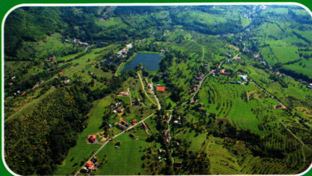
Valley of Nová Baňa with Tajch, a view from Sedlo