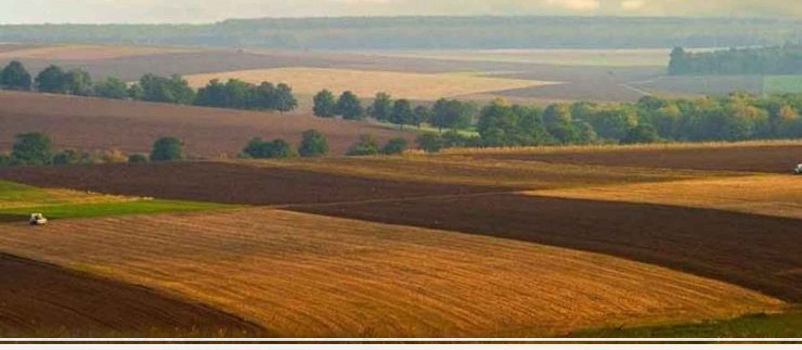
So she day after absords the beauty of Dobrudza. She loves her and keeps that love for the rest of her life.