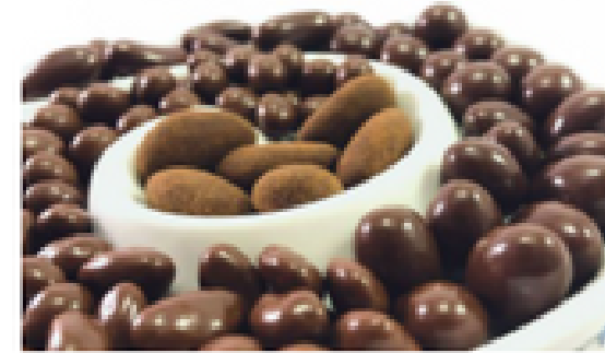
SÜTLÜ ÇIKOLATA KAPLI DRAJE