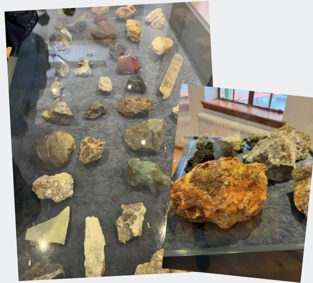
The different kinds of stones in Cyprus mountains