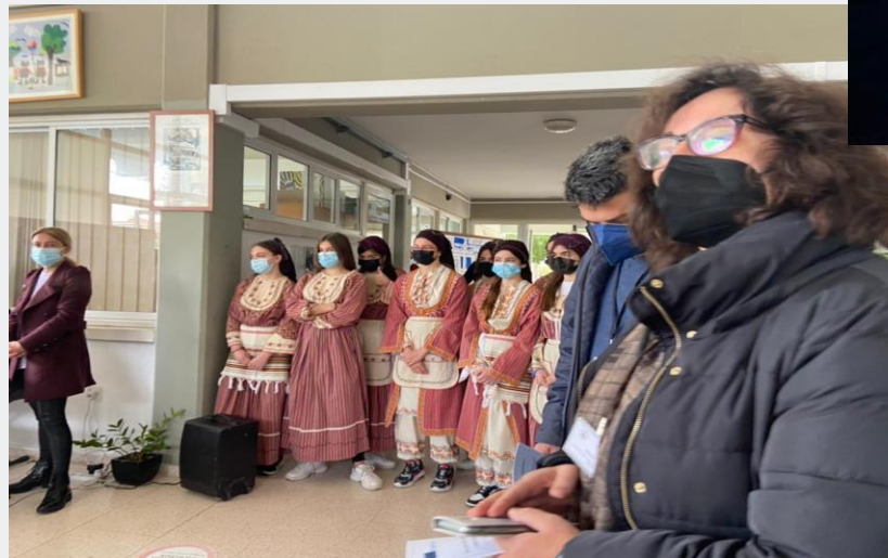
A heartwarming welcome from student and teachers