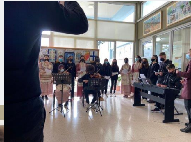
Singing and dancing