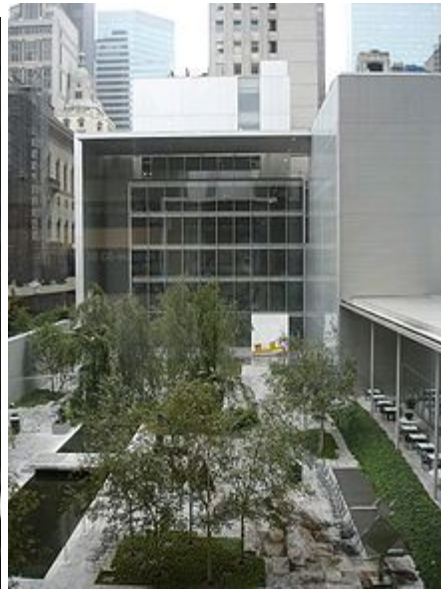
Museum of Modern Art in New York