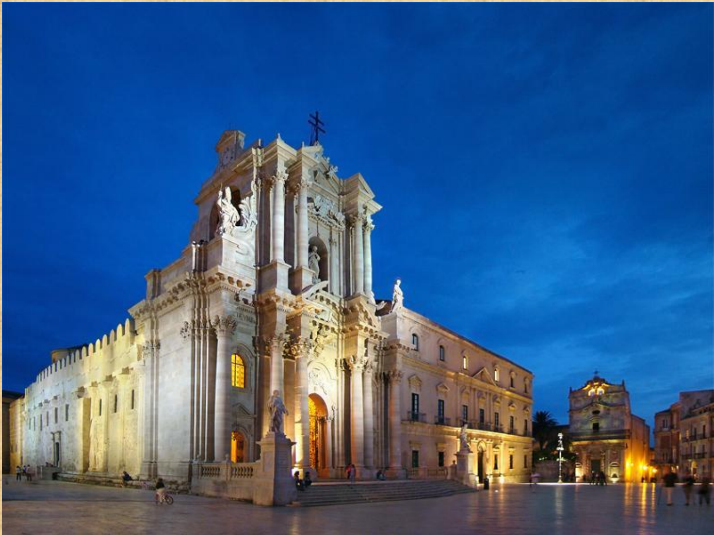
This is the cathedral of SIRACUSA. This was the temple dedicated to Athena.