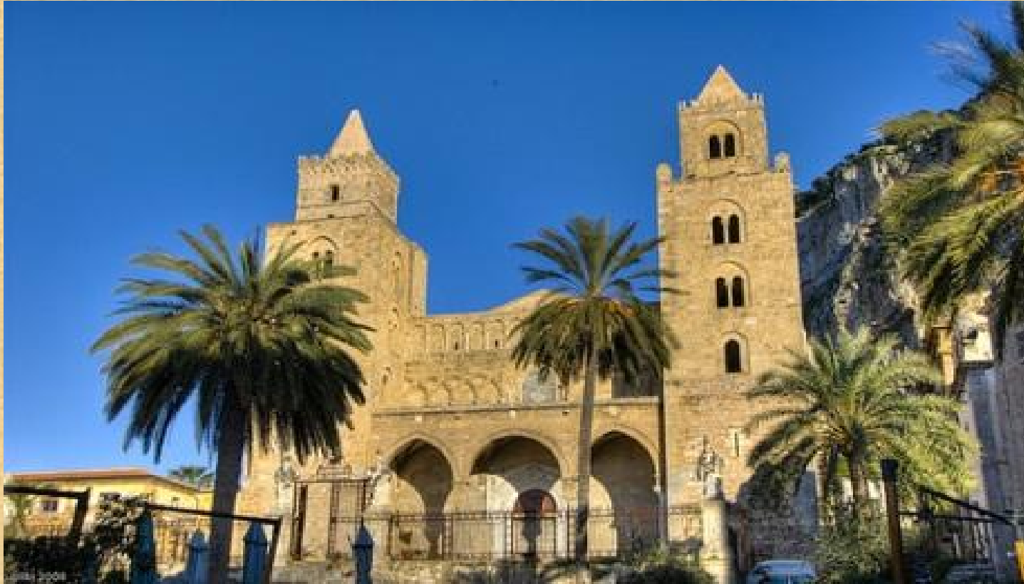
This is Cefalù. It is an old village in the south of Palermo