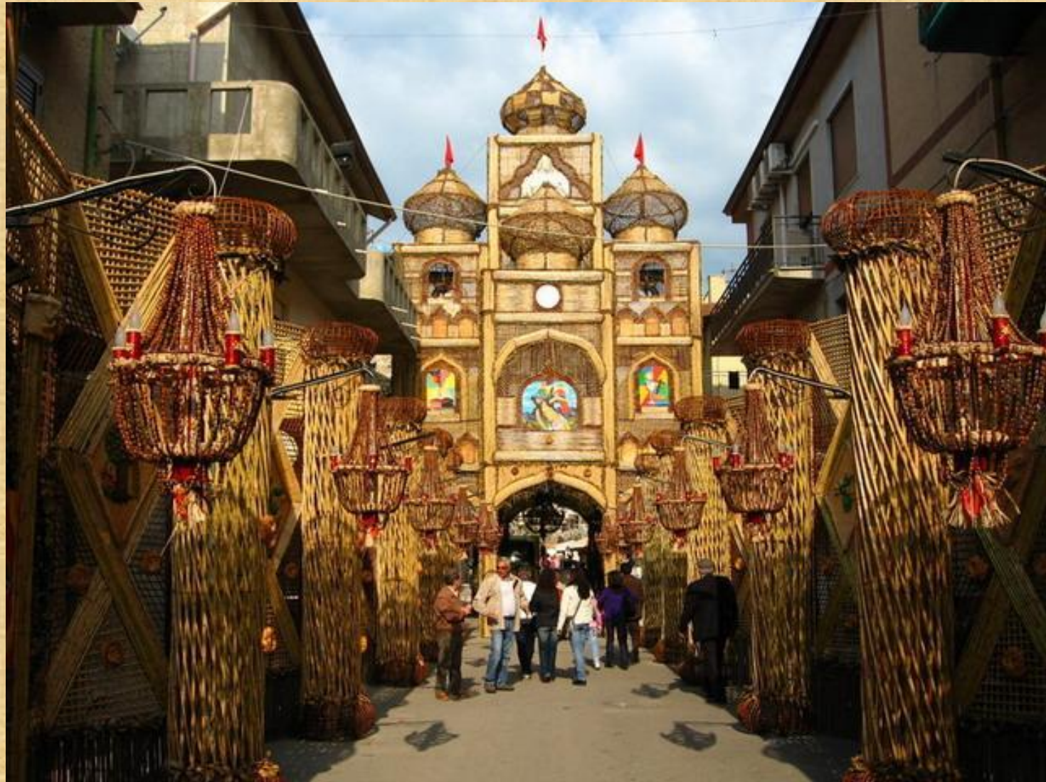
This is the arc of bread in San Biagio Platani(Agrigento)