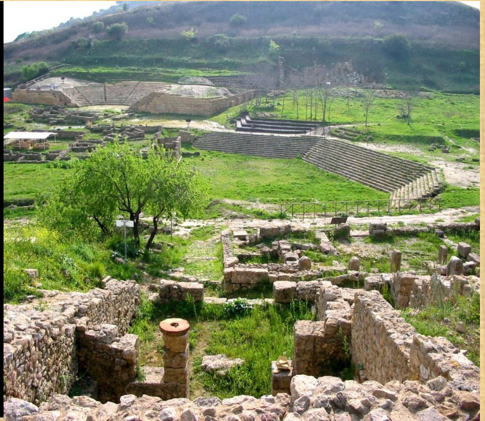
This is Morgantina's old town. Morgantina was a Greek town