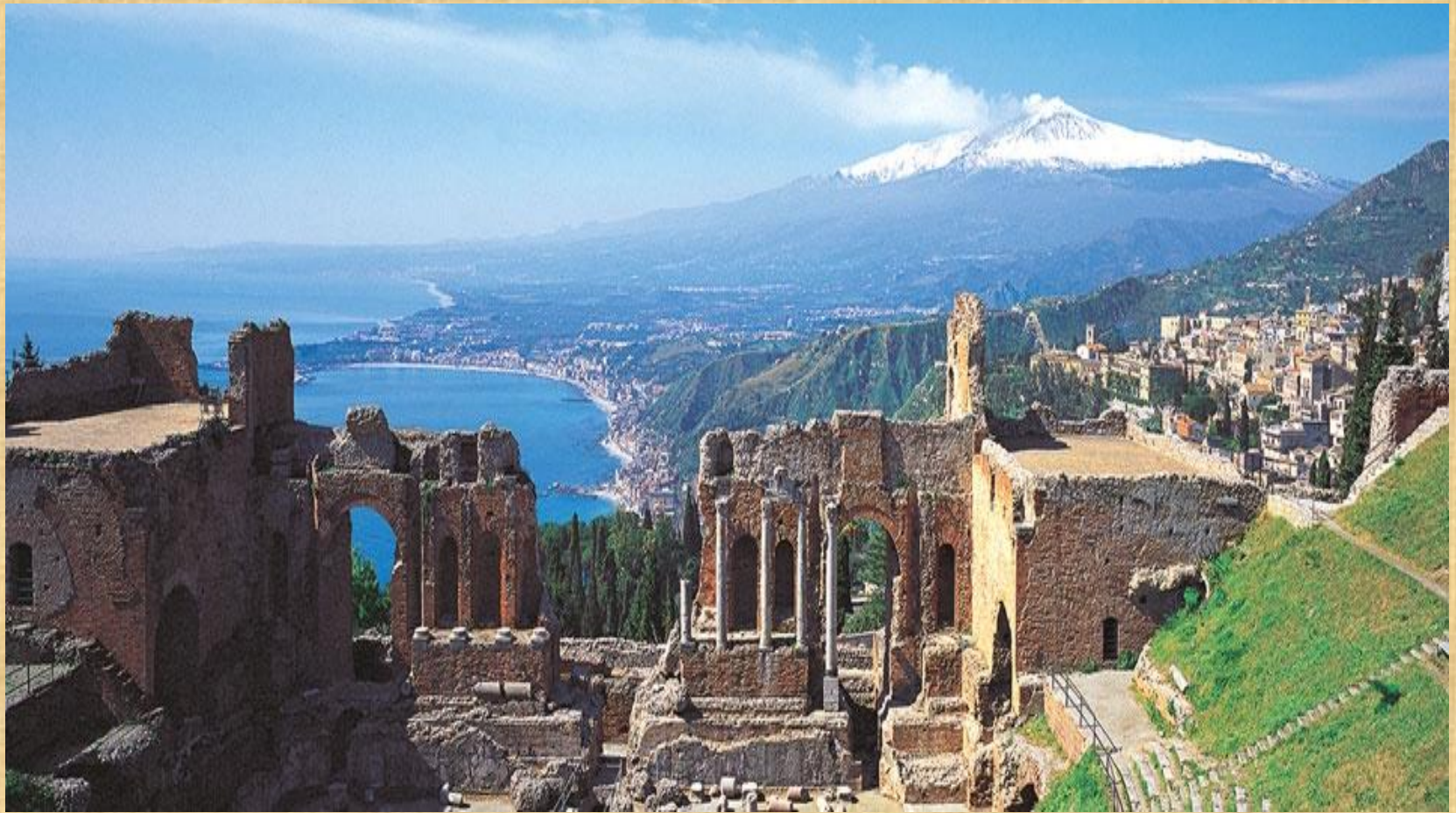
This is Taormina's greek theatre .It is very old.