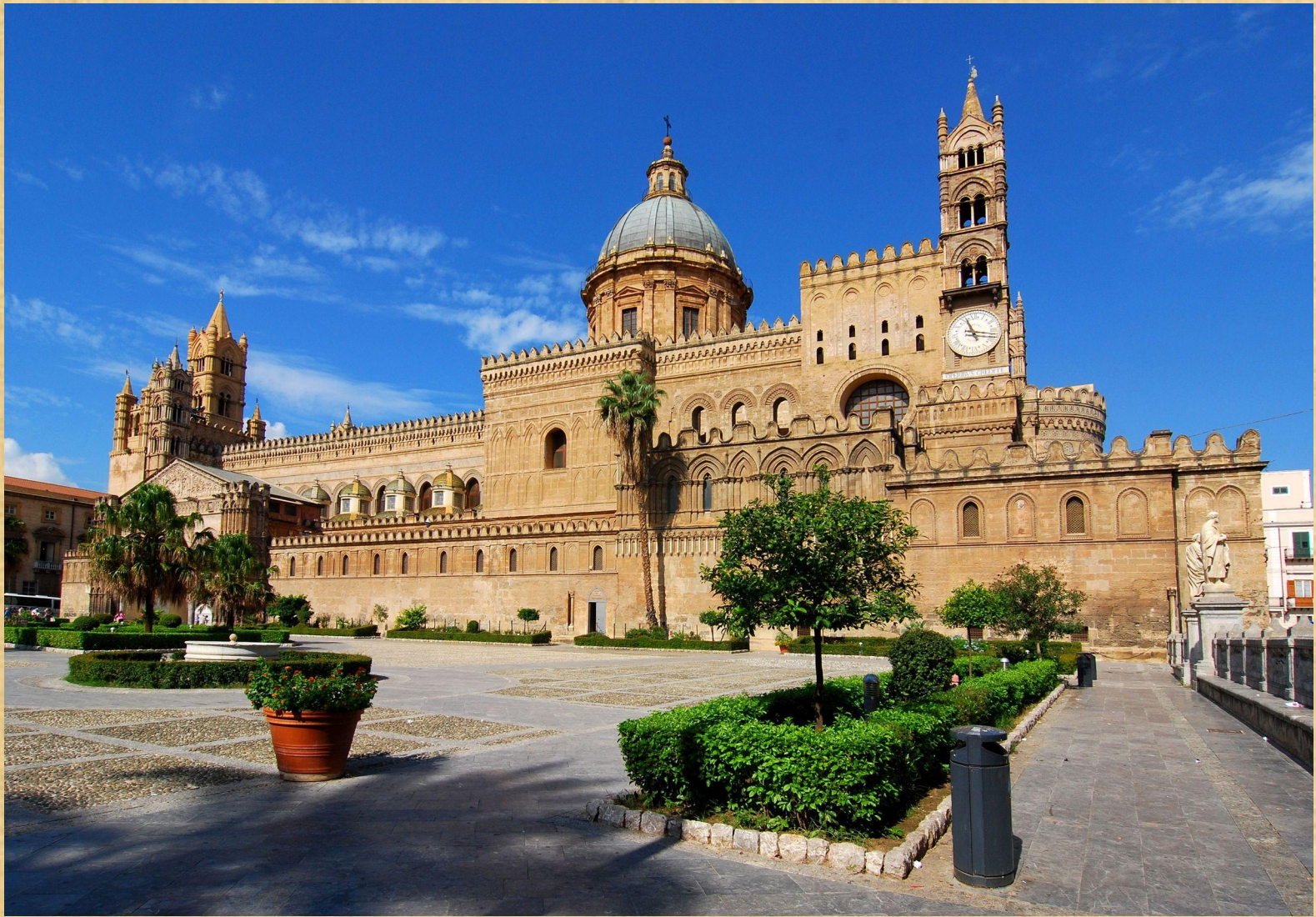
This is the Palermo's cathedra .Palermo is the chief town of Sicily