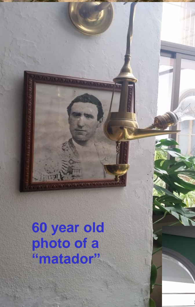
60 year old photo of a "matador"