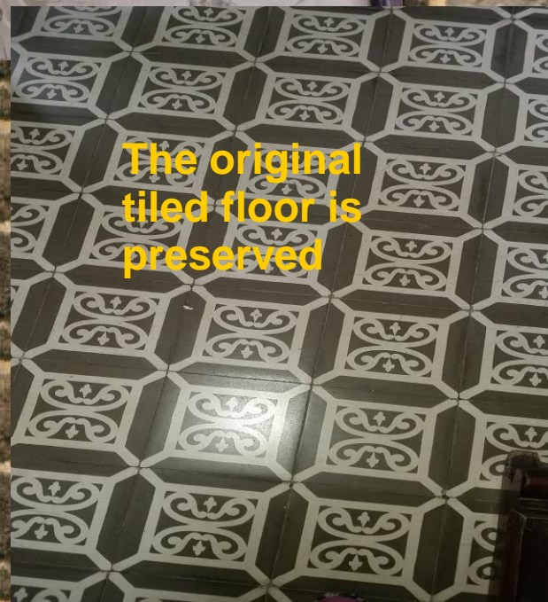
The original tiled floor is preserved