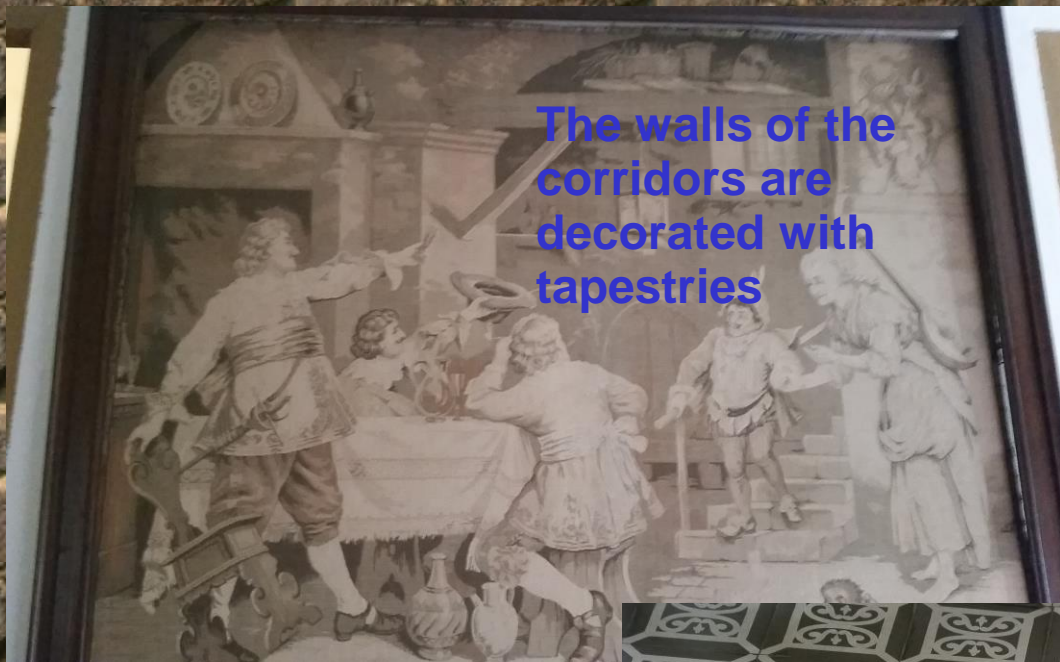
The walls of the corridors are decorated with tapestries