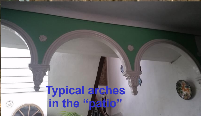
Typical arches in the "patio"