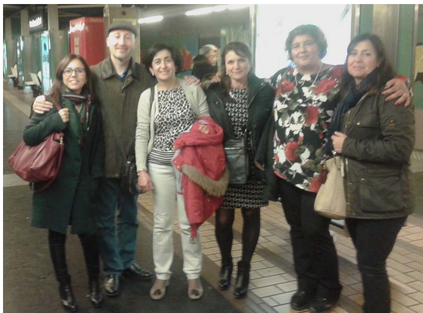
The Italian and the Spanish teams