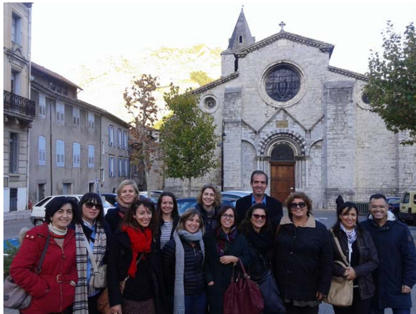
In front of the church Notre-Dame des Pommiers, formerly a Cathedral.

After a hard day's work, we all deserved a free evening. Sisteron was our destination. It is situated on the banks of the river Durance. The town boasts a magnificent citadel, dating back to the late Middle Ages, with breathtaking views from the top. Five towers remain of the 14 th century city walls. The town centre is very picturesque and is dotted with quaint little shops and buildings. We went for a nice walk along the river and through the old quarters of the town. We were able to enjoy a lovely time of camaraderie.