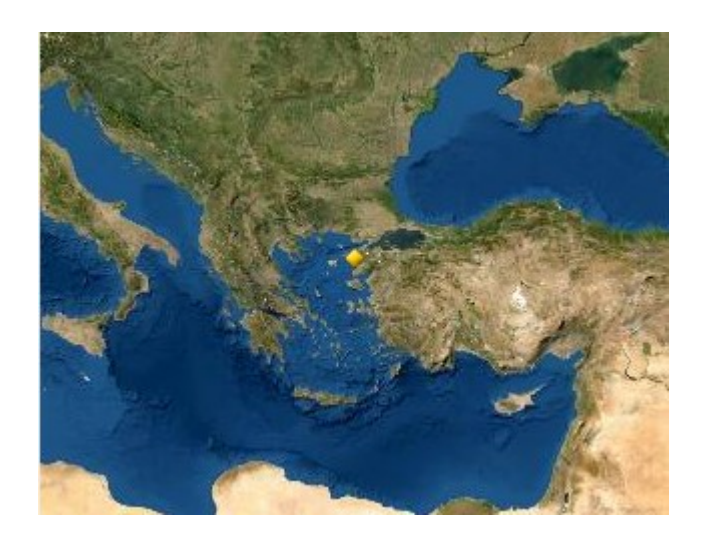
Archaeological Site of Troy

Troy, with its 4,000 years of history, is one of the most famous archaeological sites in the world. The first excavations at the site were undertaken by the famous archaeologist Heinrich Schliemann in 1870 Moreover, the siege of Troy by Spartan and Achaean warriors from Greece in the 13th or 12th century B.C., immortalized by Homer in the Iliad, has inspired great creative artists all over the the world.