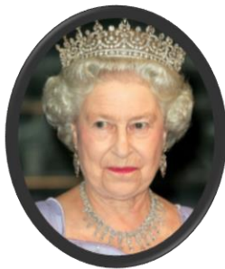
QUEEN ELIZABETH II