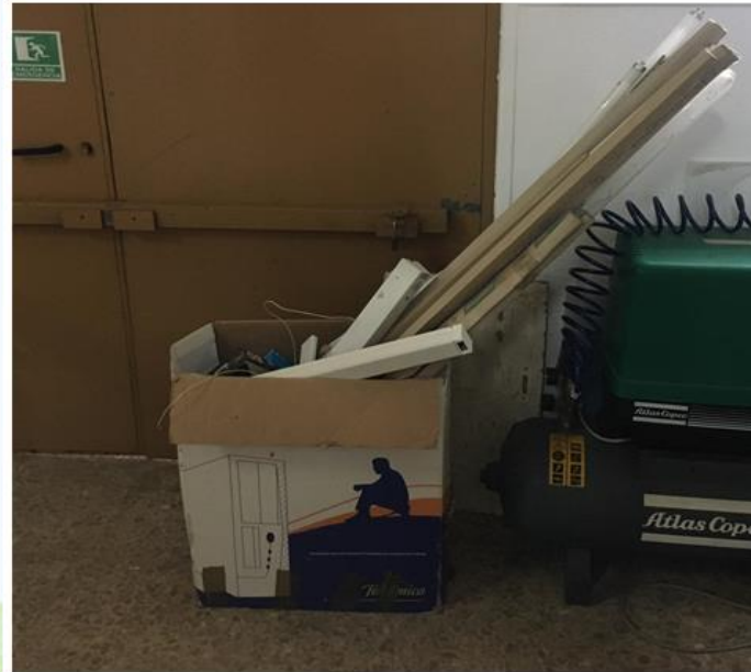
Separate and recycle electrical material