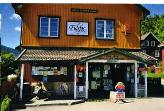
Norway's oldest grocery store is in Eidsfoss.