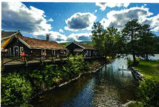
Eidsfoss in the summertime.