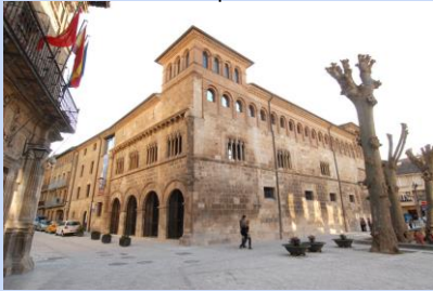
Palace of the Kings of Navarre