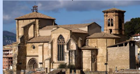
Church San Miguel