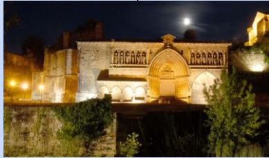
Church Santo Sepulcro