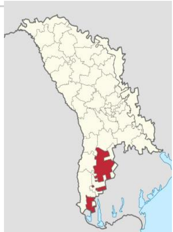
The Gagauz people living mostly in southern R.Moldova (Gagauzia)