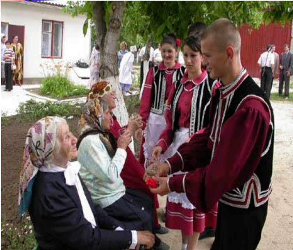
Orthodox Christian turks