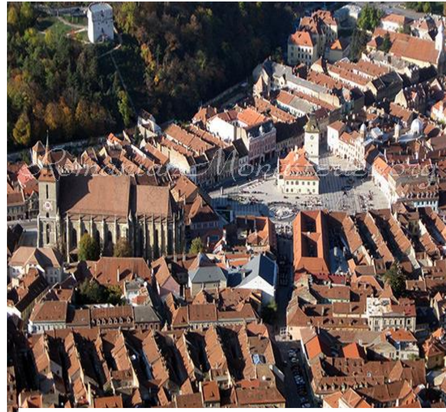
The medieval center of Braşov

The Saxons give us 7 beautiful cities in Transilvania Braşov / Kronstadt; Sibiu / Hermannstadt and others.