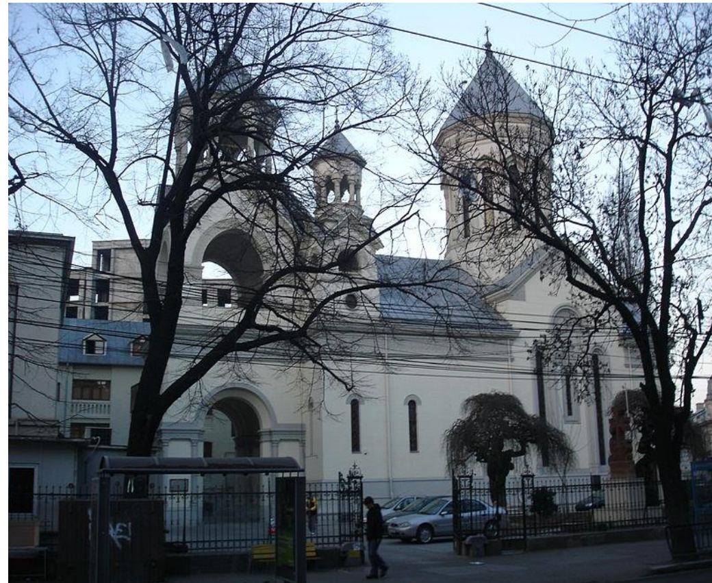
Bucharest Armenian Church

In 13th-14th centuries – a lot of Armenians leave Armenia. They came here to Romanian lands for a new and peaceful life.