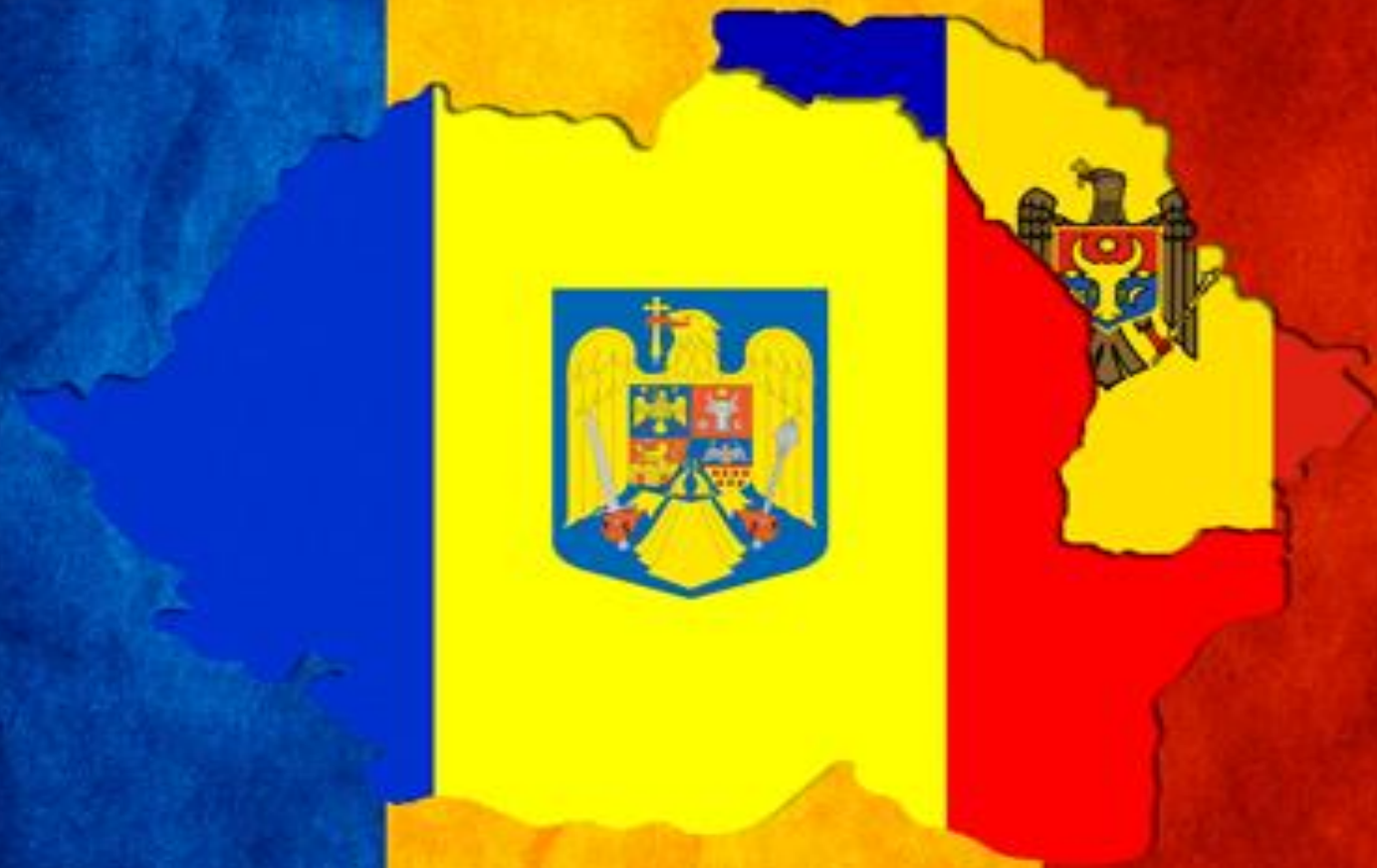
Republic of Moldova – the second Romanian state