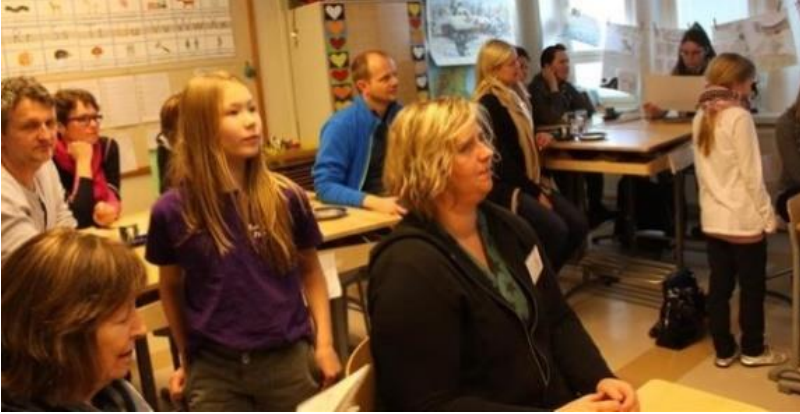
council introduced oneself too.

Thursday was a very busy day. We visited in a small village school in the countryside. They explained how they put into action the anti-bullying strategy. They work a bit differently compared with Kausalan koulu. The Parents