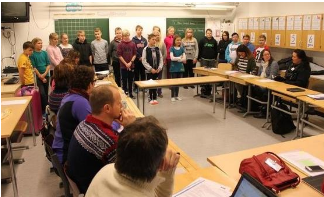
The Class 6A sang to visitors.