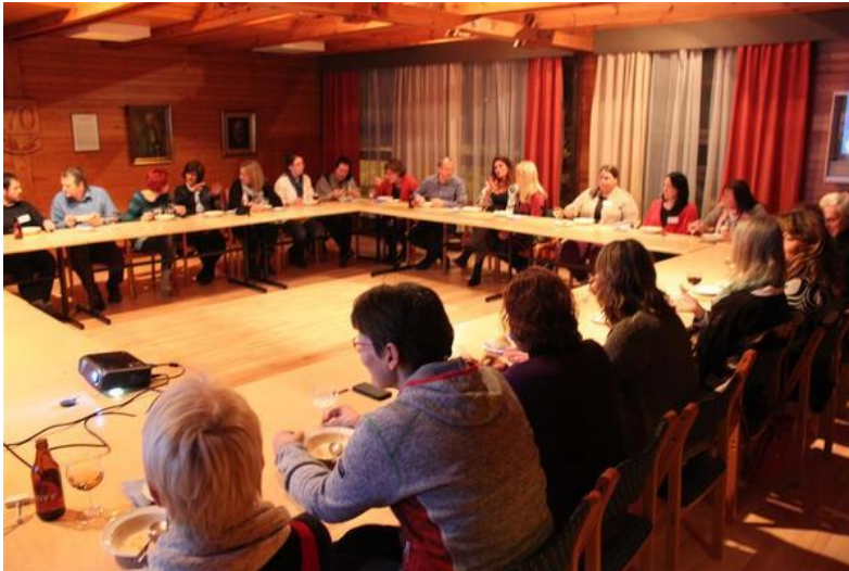
Erasmus Knights of The Square Table ☺.