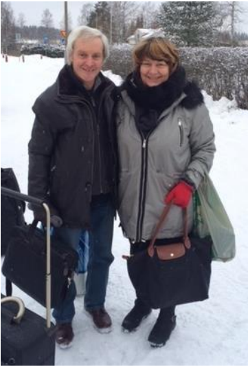
The first participants departed to the airport from Kausala railway station. It was really nice to have you here!