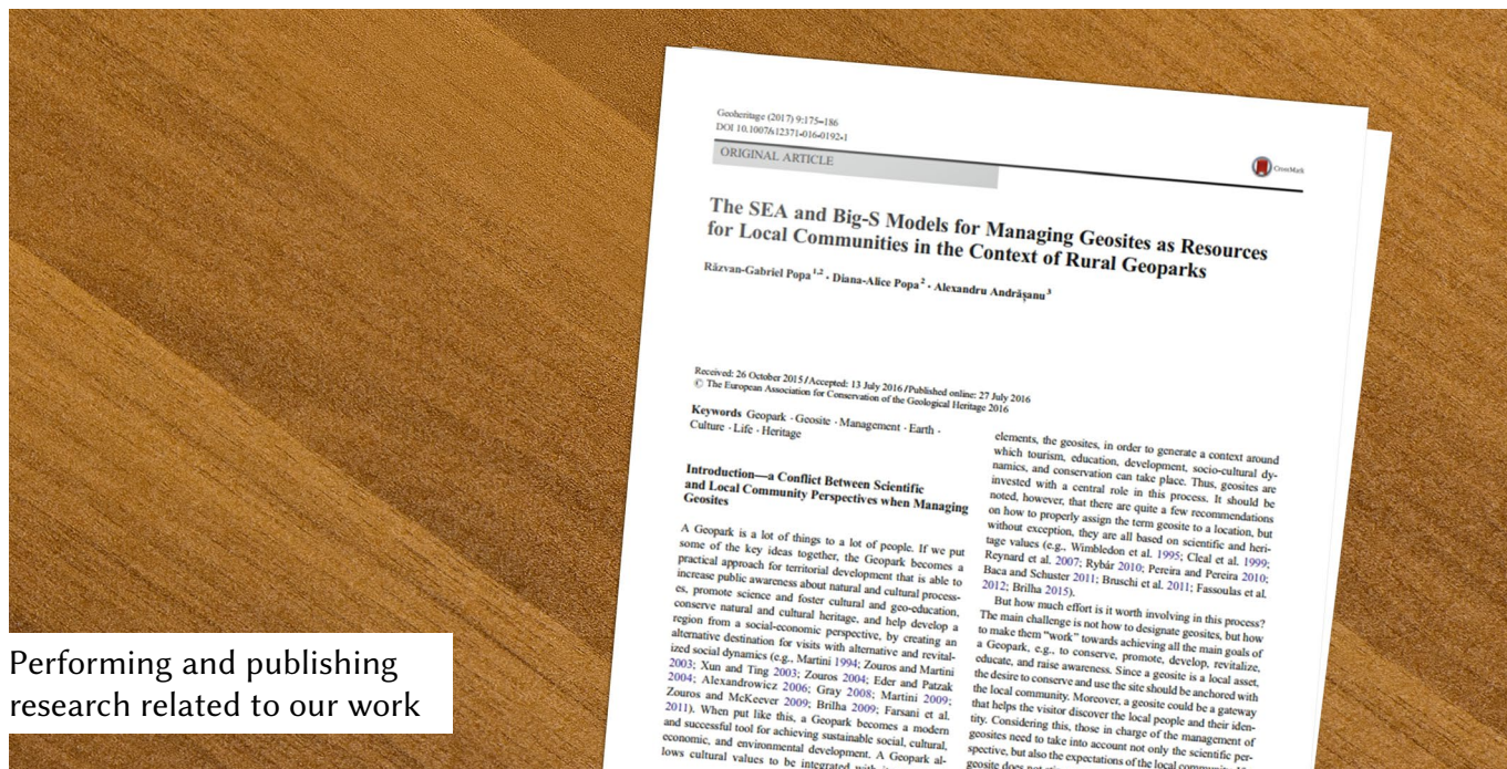
Performing and publishing research related to our work