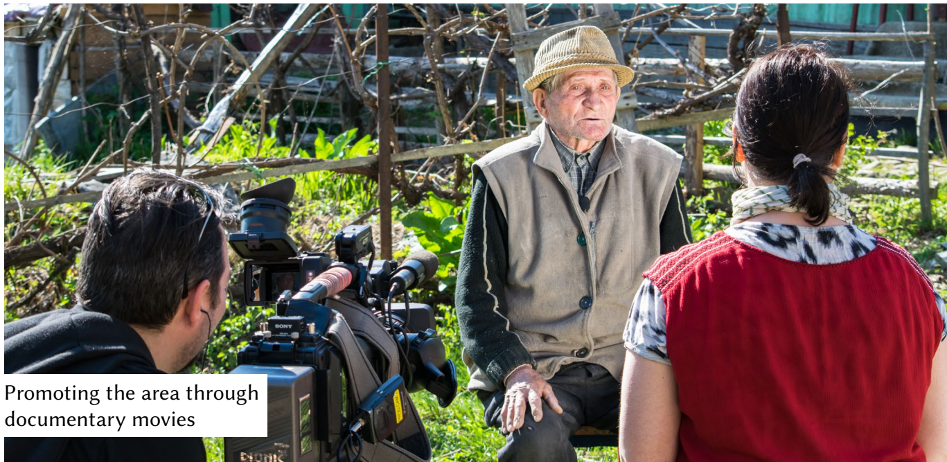
Promoting the area through documentary movies