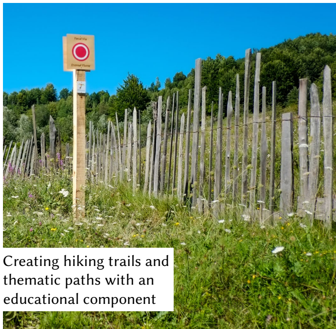
Creating hiking trails and thematic paths with an educational component