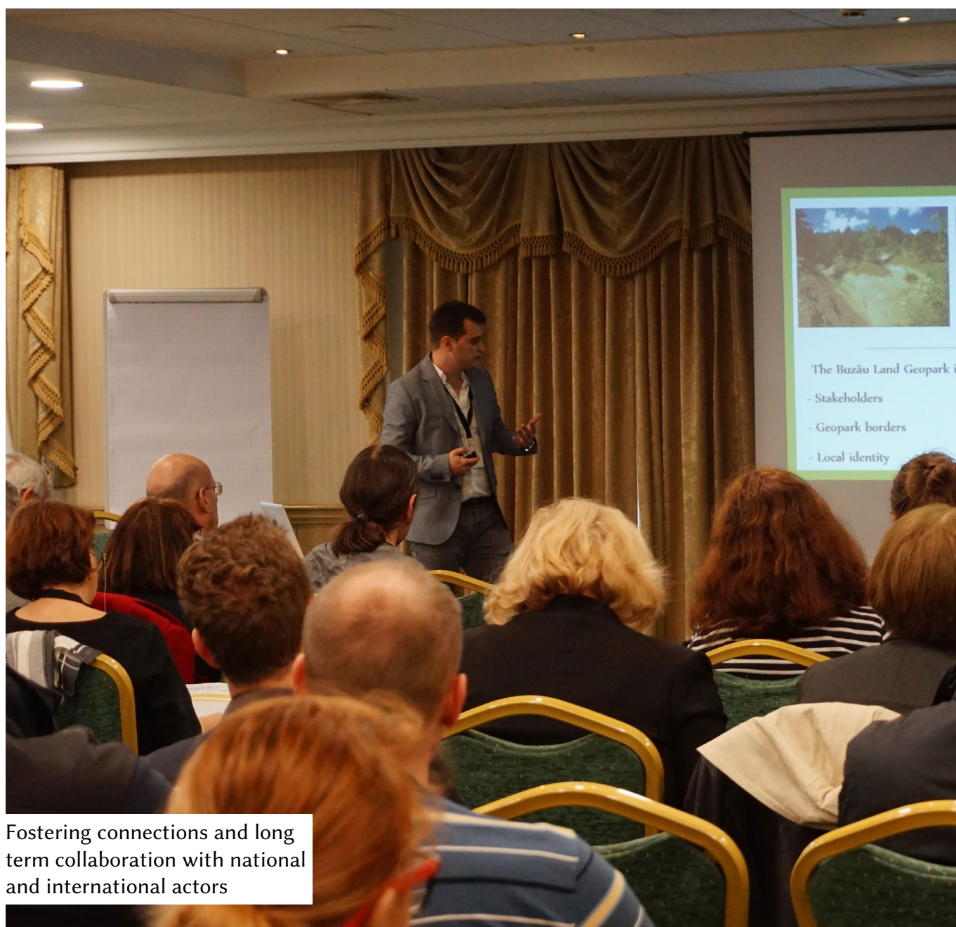
Fostering connections and long term collaboration with national and international actors