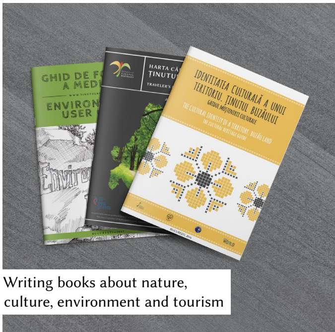
Writing books about nature, culture, environment and tourism