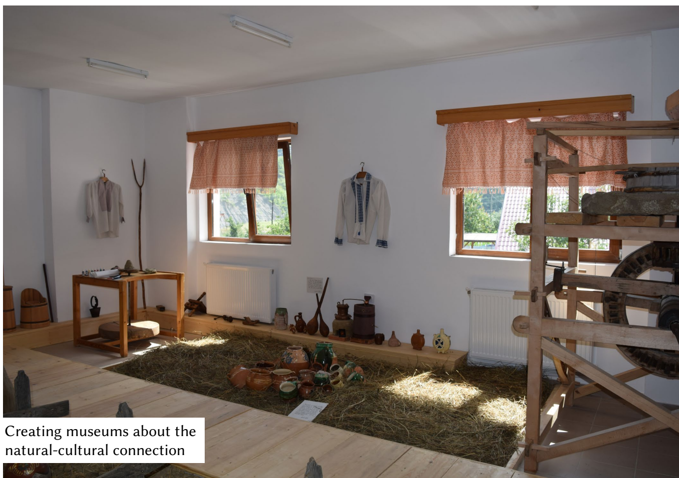
Creating museums about the natural-cultural connection

Our team started implementing the development strategy of Buzău Land in 2014. These are a few of the areas we worked in since then: