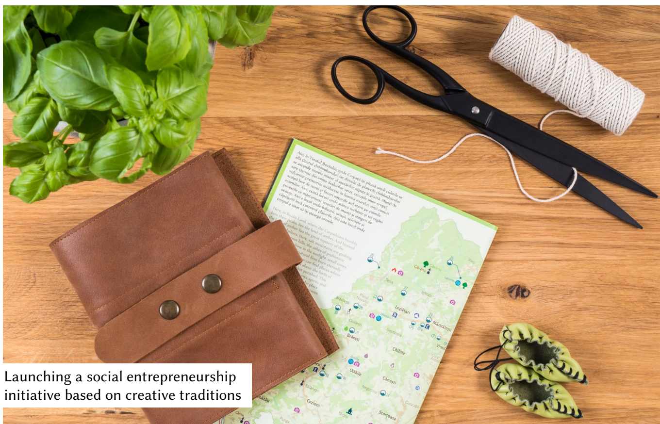
Launching a social entrepreneurship initiative based on creative traditions

Creating a virtual infrastructure to promote the area