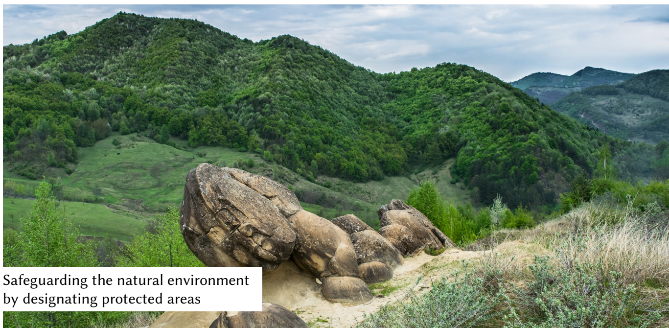
Safeguarding the natural environment by designating protected areas