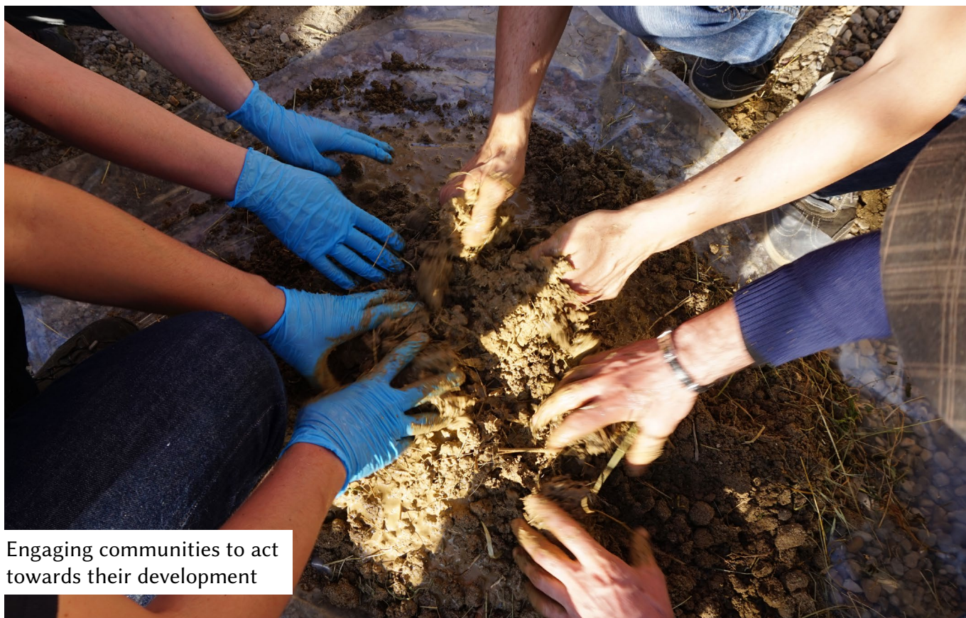
Engaging communities to act towards their development