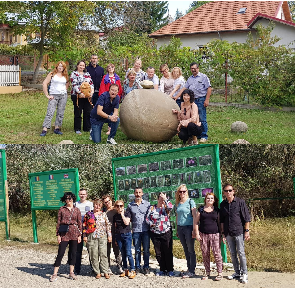
'Acest proiect este finantat cu sustinere din partea Comisiei Europene. Această publicatie [comunicare] reflectă doar vederile autorului, iar Comisia nu poate fi făcută responsabilă pentru utilizarea informatiei pe care o contine.'