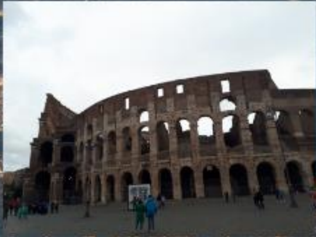
Colosseum in Rome