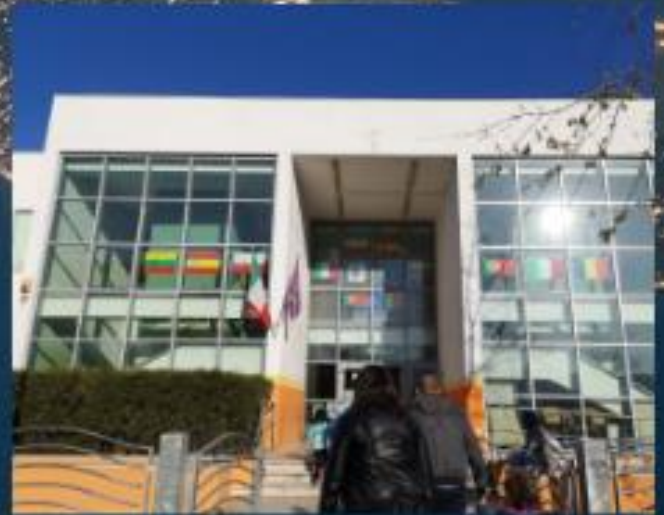
ISTITUTO COMPRESIVO GALILEO GALILEI, San Giovanni Teatino