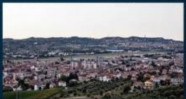
The view of San Giovanni Teatino