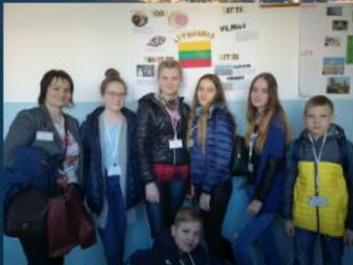
A team of students and teachers in Italy