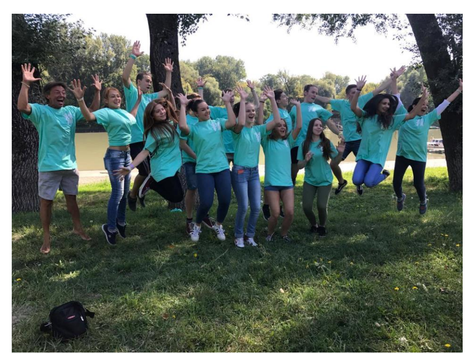
The last day we did a team picture together.