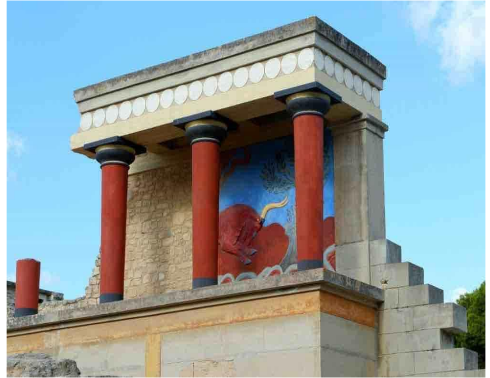
KNOSSOS PALACE- MINOAN CIVILISATION