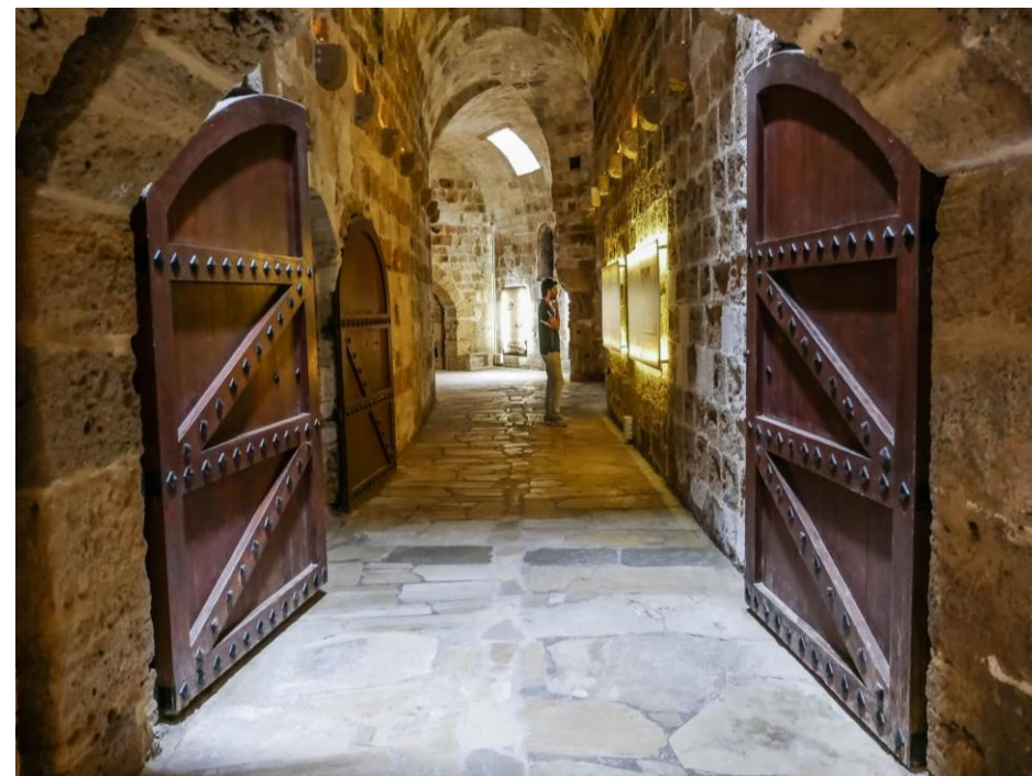
INSIDE KOULES (VENETIAN FORTRESS)