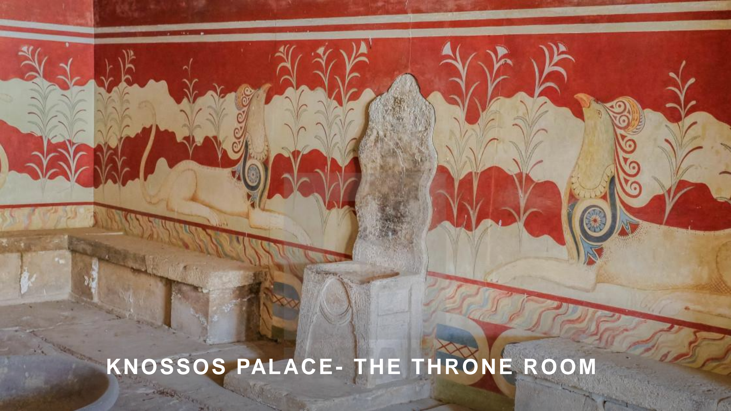
KNOSSOS PALACE- THE THRONE ROOM