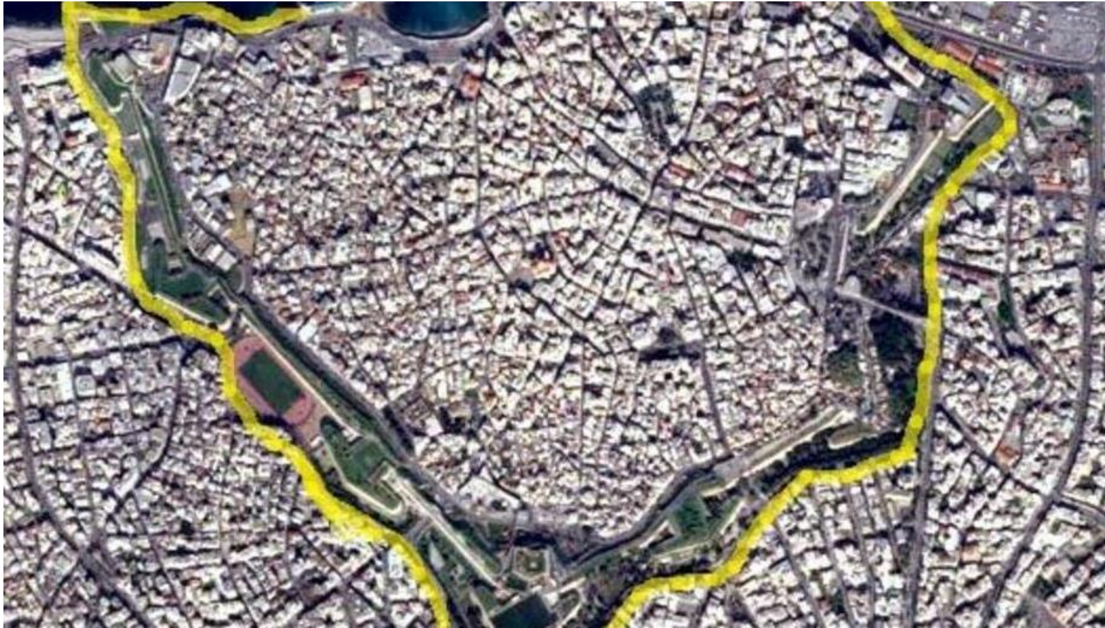
VENETIAN WALLS AROUND CITY CENTER