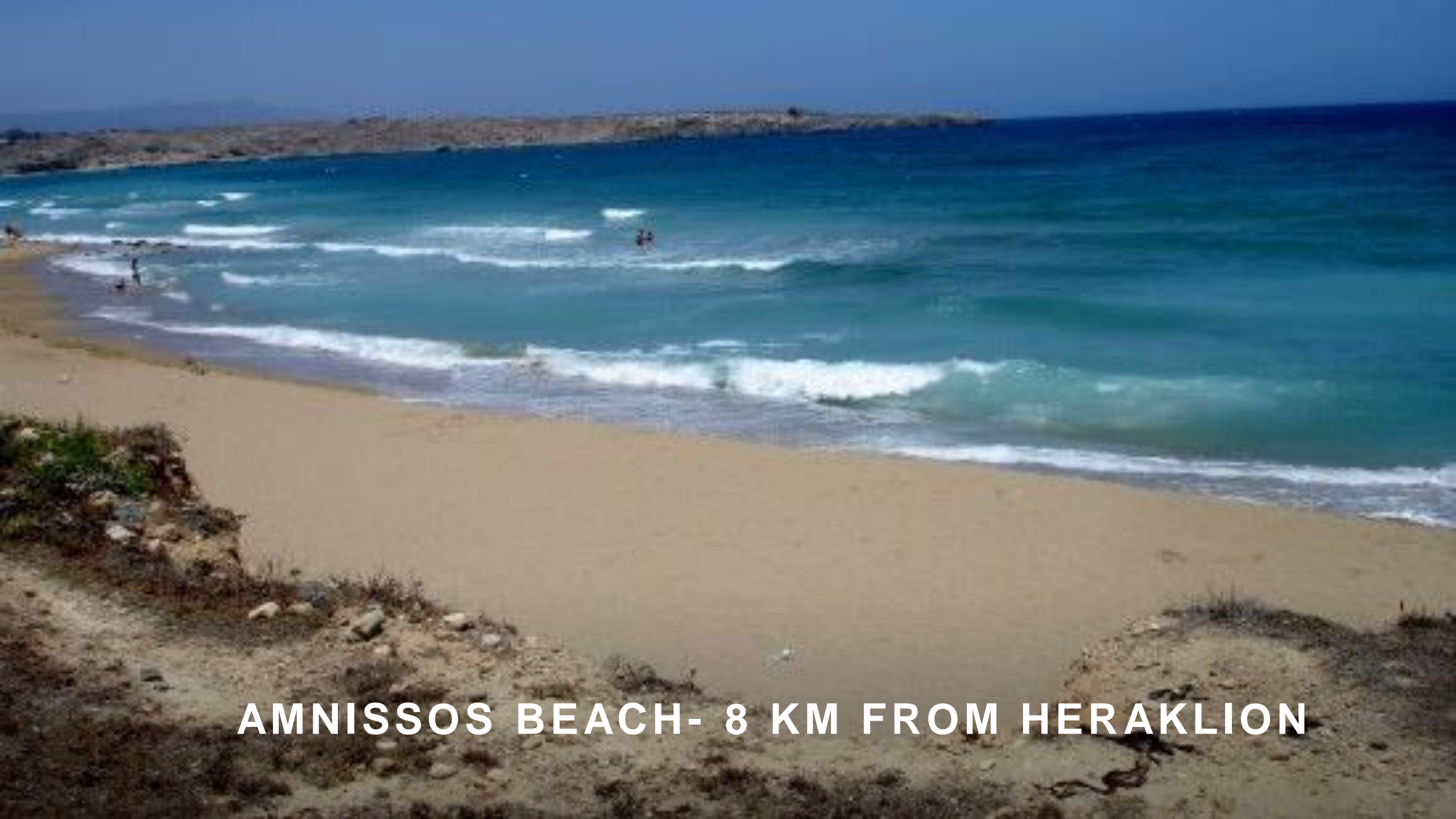
AMNISSOS BEACH- 8 KM FROM HERAKLION