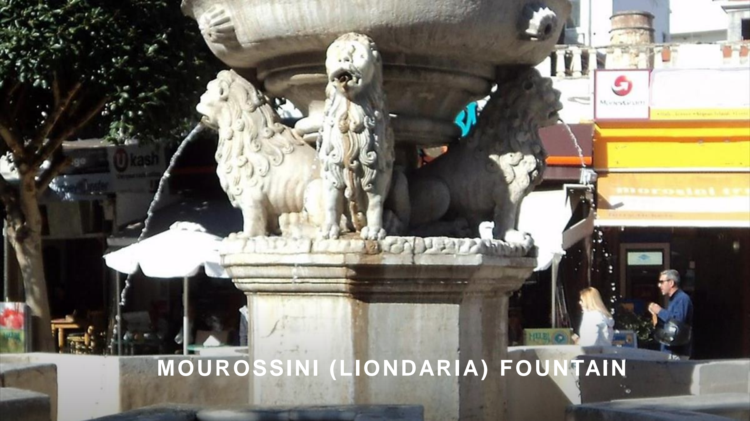
MOUROSSINI (LIONDARIA) FOUNTAIN