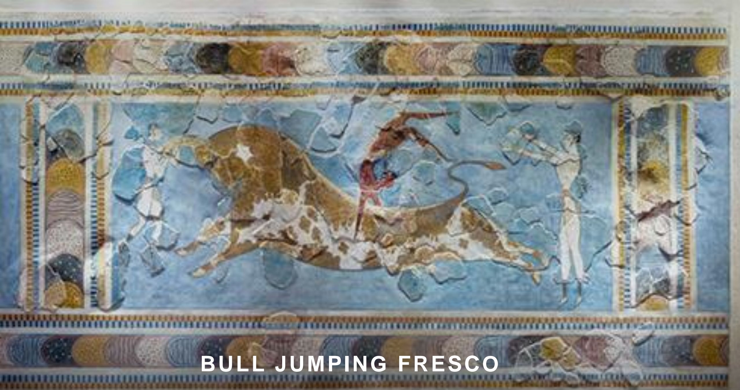
BULL JUMPING FRESCO