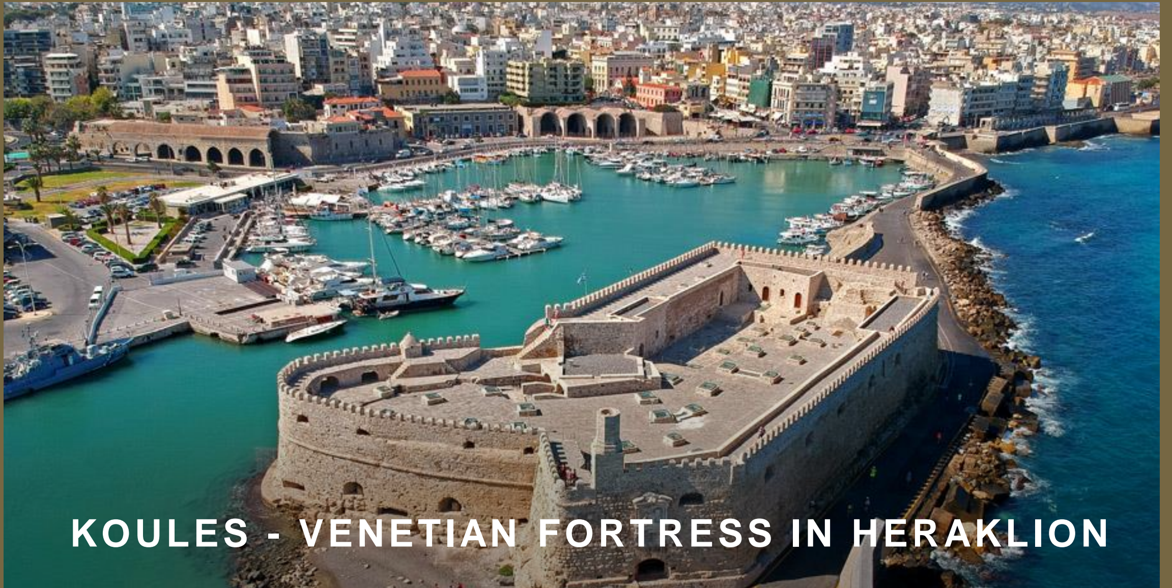
KOULES - VENETIAN FORTRESS IN HERAKLION