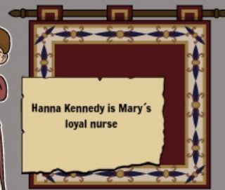
Hanna Kennedy is Mary's loyal nurse

Elisabeth I. rules England, but she has to face Catholic assassins all the time because she is protestant and, even worse, she is the daughter of Anna Boleyn, who was executed by Henry VIII, because of adultery. That means Elisabeth is no legitimate child but a "bastard". Therefore some people think she has no right to be queen and should be replaced by Mary, who is not only catholic but also a Tudor and legitimate child.