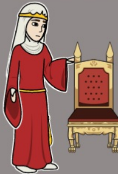
Elisabeth I., Queen of England

Elisabeth I. rules England, but she has to face Catholic assassins all the time because she is protestant and, even worse, she is the daughter of Anna Boleyn, who was executed by Henry VIII, because of adultery. That means Elisabeth is no legitimate child but a "bastard". Therefore some people think she has no right to be queen and should be replaced by Mary, who is not only catholic but also a Tudor and legitimate child.