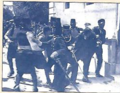
Le 28 juin 1914, c'est l'étincelle : l'archiduc héritier d'Autriche est assassiné à Sarajevo. L'Autriche déclenche les hostilités. En plein cœur de l'été 1914, la Première Guerre mondiale éclate.

Les déclarations de guerre se succèdent et très rapidement l'Autriche et l'Allemagne, rejointes plus tard par la Turquie et la Bulgarie, se retrouvent en guerre contre la Serbie, la Russie, la France, la Belgique et la Grande-Bretagne, puis l'Italie et la Roumanie.