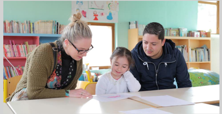
Interview with the parents