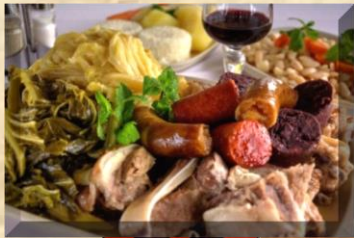
Artifact 22: Food “Cozido à Portuguesa”