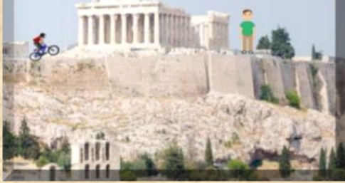
Artifact 11: Acropolis

The Acropolis of Athens is an ancient citadel located on a rocky outcrop above the city of Athens and contains the remains of several ancient buildings of great architectural and historic significance, the most famous being the Parthenon