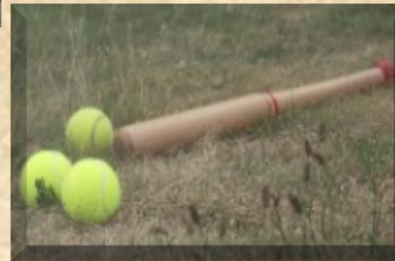
Artifact 29: Game "Palant"