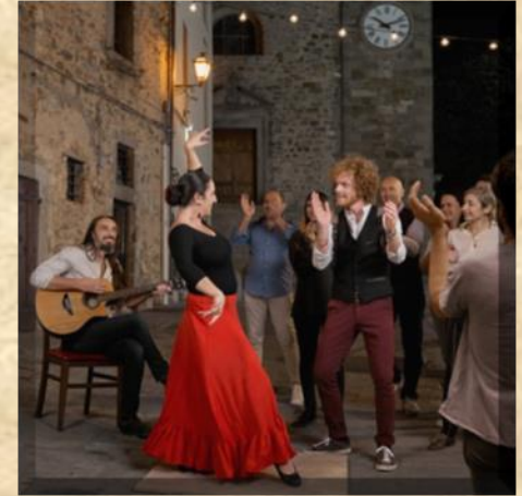
Artifact 20: Flamenco