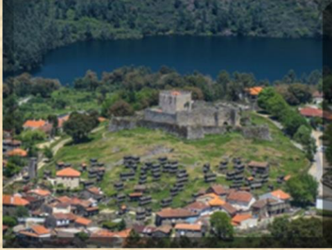
Artifact 21: “Natural Park Peneda da Gerês”