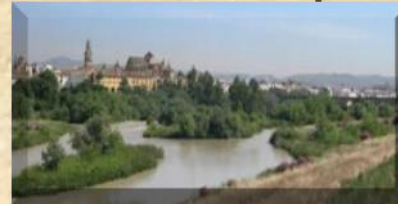
Artifact 19: Río Guadalquivir