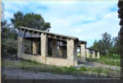
Artifact 1: Archaeological site of “Malloura”