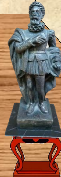
Artifact 25: “Luís Vaz de Camões”