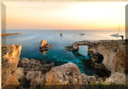
Artifact 3: Cape "Kavo Greko"