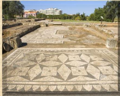
Artifact 23: “Milreu”