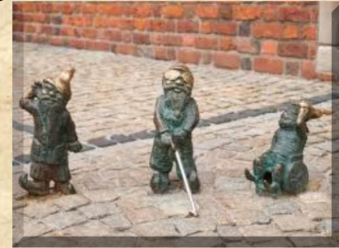
Artifact 30: Sculptures Wroclawskie Krasnale