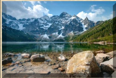
Artifact 28: Morskie Oko ("Sea Eye" or "Eye of the Sea")