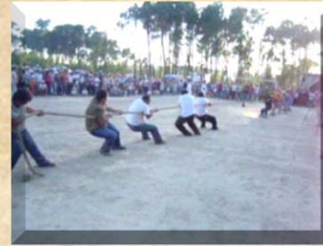
Artifact 24: “String Tension”