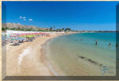
Artifact 33: Salento