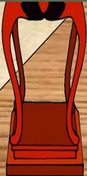
Artifact 32: Food Pizza