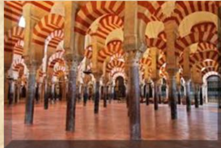
Artifact 18: Mezquita Catedral