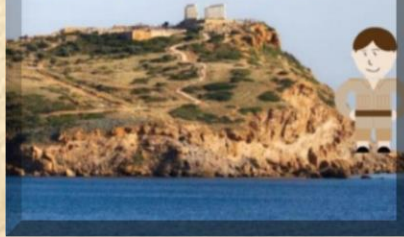
Artifact 13: Sounio

Sounio is one of the most popular coast in Greece and an important archaeological places in Greece . Sounio was the temple of Poseidon. In my opinion, Sounio is one of the most beautiful coast in Europe