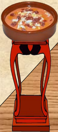
Artifact: 17 Salmorejo