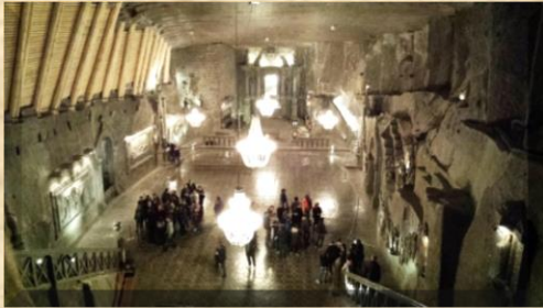
Artifact 26: Wieliczka Royal Salt Mine