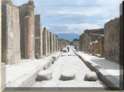
Artifact 31: Archaeological site "Pompei"