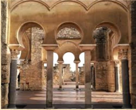
Artifact 16: Medina Azahara