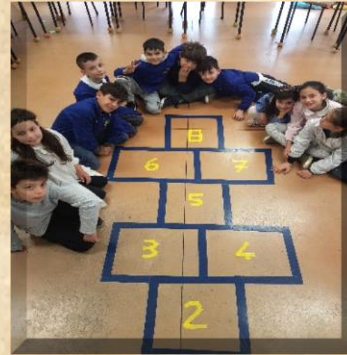
Artifact 34: Game: "Hopschotc"