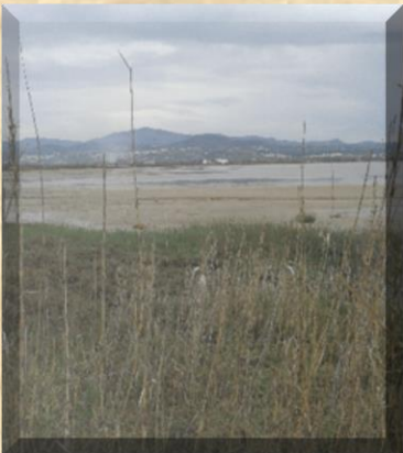
Artifact 8: Salt lake "Aliko"