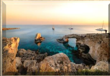
Artifact 4 Cape “Kavo Greko”