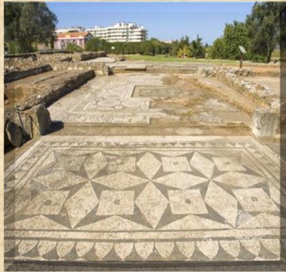
Artifact 23: Milreu”