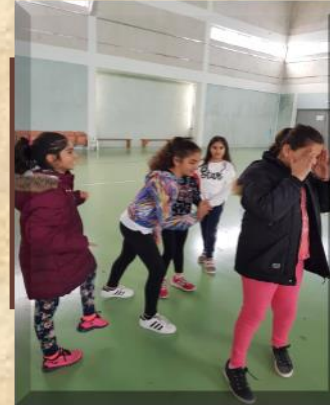
Artifact 4: Game “Ziziros”