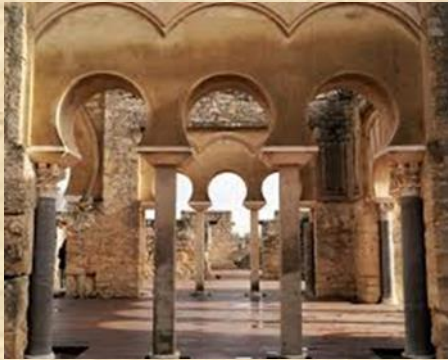
Artifact 16: Medina Azahara