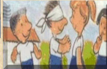
Artifact 14: Game "Blindfold"