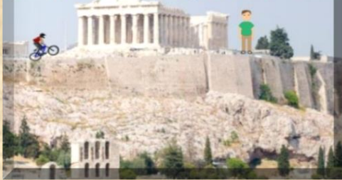
Artifact 11: Acropolis

The Acropolis of Athens is an ancient citadel located on a rocky outcrop above the city of Athens and contains the remains of several ancient buildings of great architectural and historic significance, the most famous being the Parthenon