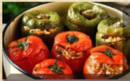
Artifact 12: Food Gemista