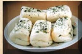
Artifact 2: Food Cyprus Halloumi