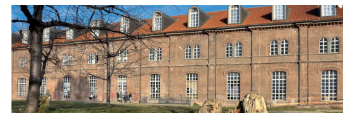
ITALIAN SCHOOL Albe Steiner