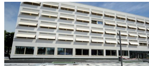
GERMAN SCHOOL Robert Bosch Fos