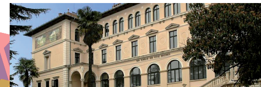
CROATIAN SCHOOL Srednja škola Zvane Črnja