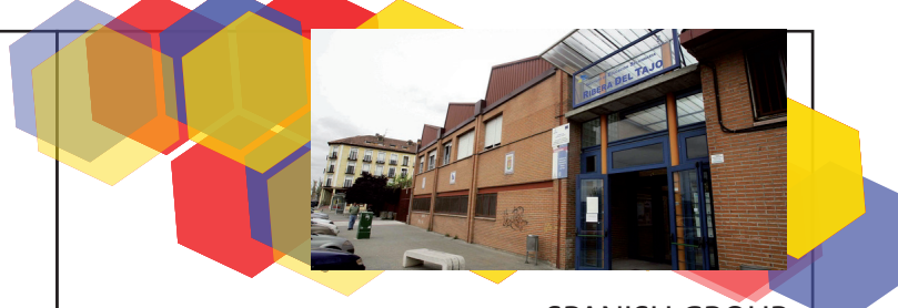
SPANISH GROUP Ribera de Tajo