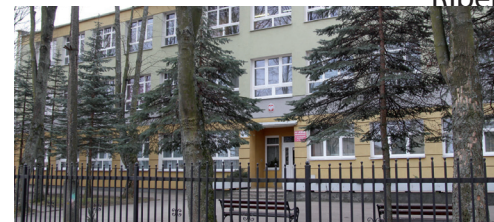
POLISH SCHOOL IV Liceum im. K. K. Baczynskiego