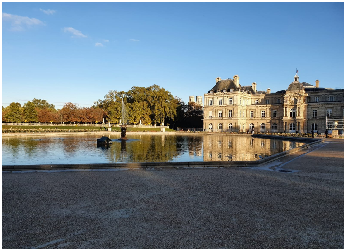
JARDIN DU LUXEMBOURG