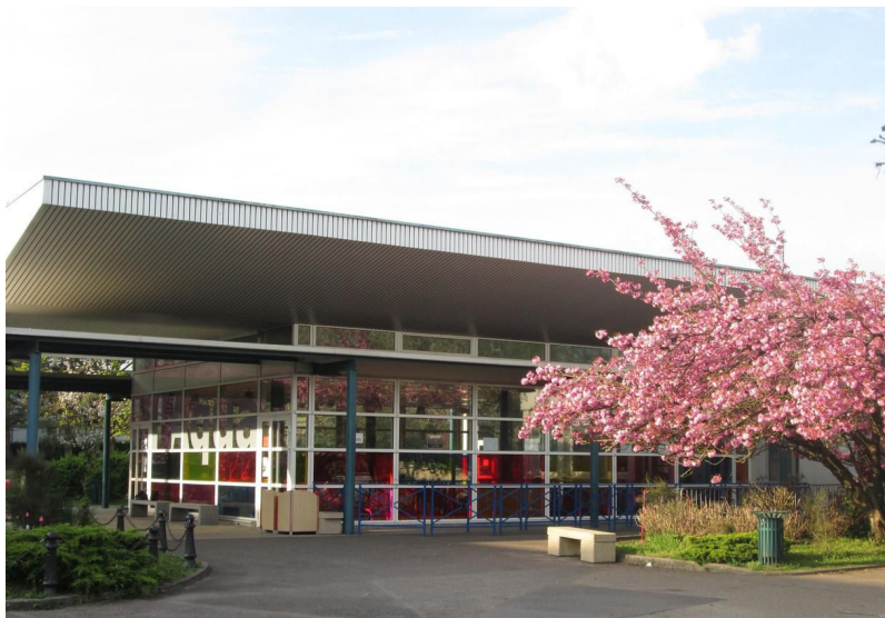
LYCÉE EVARISTE GALOIS

On Thursday we went through different themes...the theme of cancer and associations to receive support; the theme of cultivation (by learning how to create a seed bomb); the theme of spreading culture to people of our age thanks to a Polish programme ecc ecc... In the evening we went to Paris and we made a tour with the bus, having the possibility of watching the most important heritages of Paris and of knowing their history.