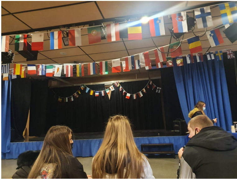
LYCÉE EVARISTE GALOIS

All the activities started on Monday. Day in which we met with the Sanator who made us aware of the political European situation. But that's not all for this beautiful day, in fact, it continued with an activity in Montmartre that gave us the possibility to acquire team work skills and to socialize with the other groups.