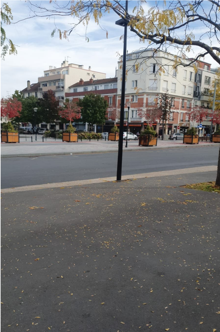
STATION OF SARTROUVILLE

On Sunday morning, we as a team, went to Paris in order to participate to the first mobility of the project "Get involved, Erasmus". We were expecting an enjoyable week but now, at the end of this experience we can honestly say that reality was better than expectations. We didn't only visited enjoyable places but we have also had the possibility to GET INVOLVED in French's people lives and to discover cultures that were unknown to us.