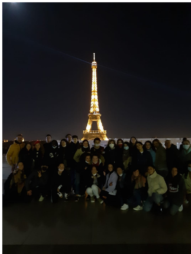
ERASMUS TEAM UNDER THE EIFFEL TOWER