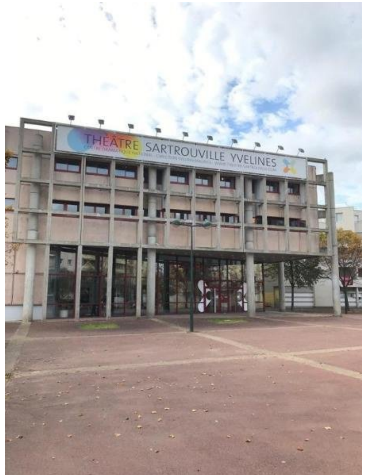
THEATRE SARTROUVILLE YVELINES