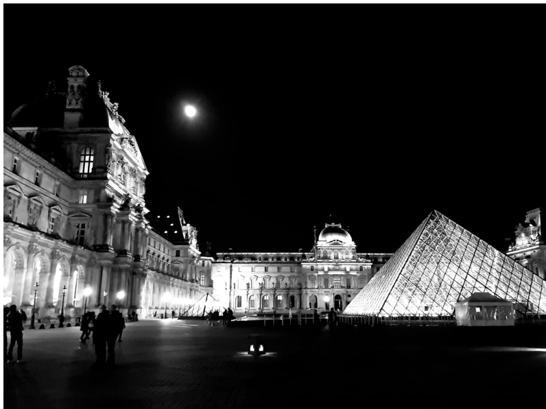
MUSÉE DU LOUVRE