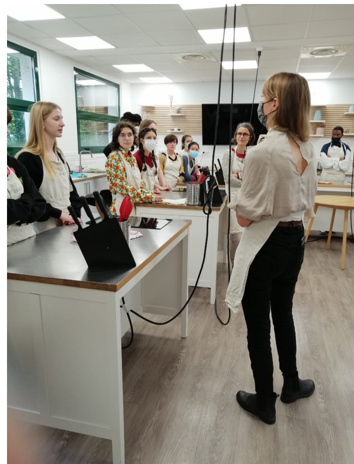
WORKSHOP ABOUT THE WASTING OF FOOD