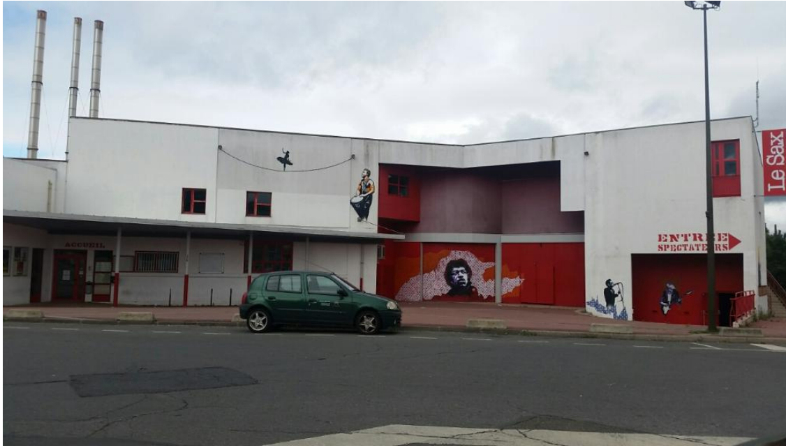
SAX THEATRE ACHÈRES

On Tuesday, we participated to a meeting that let us understand how film production and music production work and we loved trying producing a song and short animations in first person. Another time, activities helped us speaking to other countries' people in order to practice language skills and to exchange our culture. The day ended with the vision of a jazz concert.