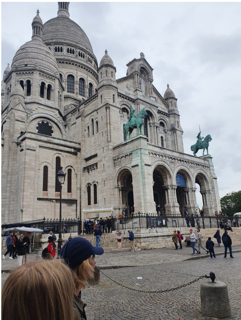
SACRE COEUR DE PARIS