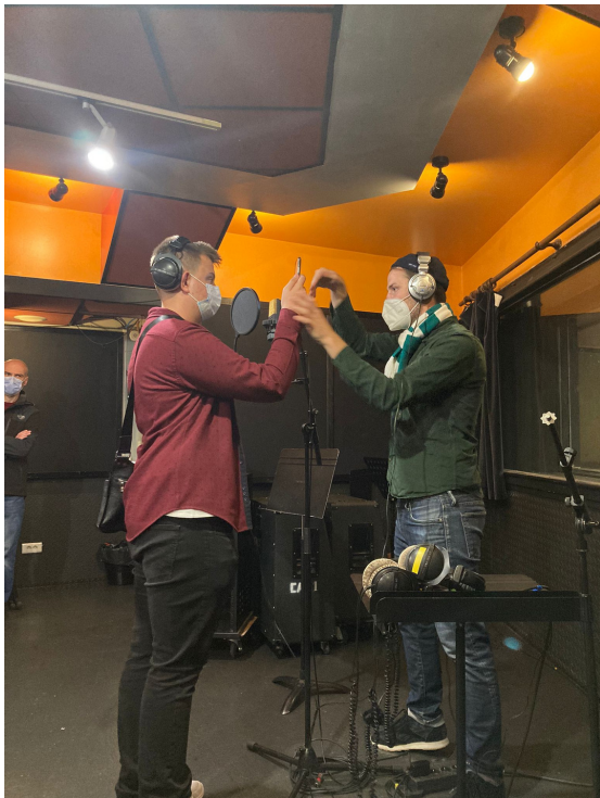
REGISTRATION STUDIO OF THE THEATRE