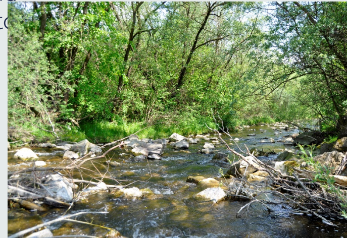
The Laborec near the village Čertižné