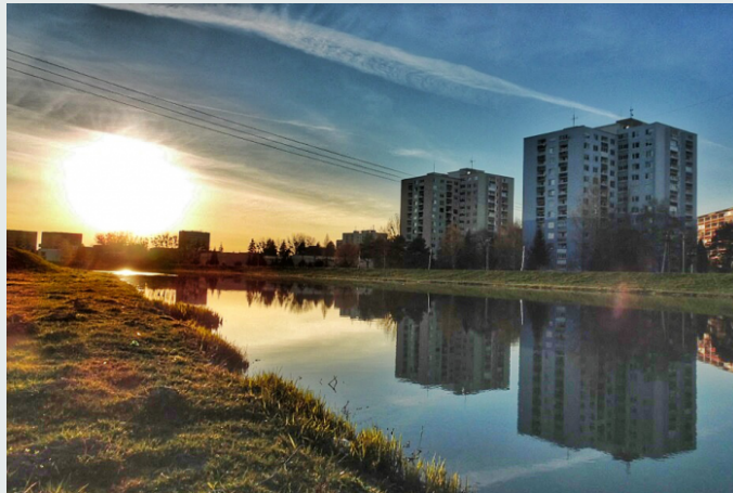
The Laborec near the town Humenné