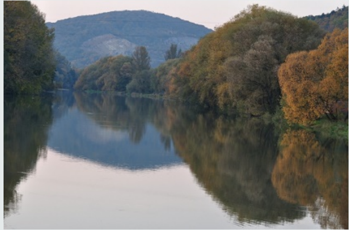
The Laborec near the town Strážske