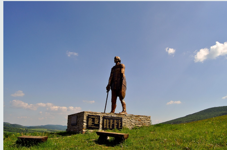
Statue of magnate Laborec in village Habura