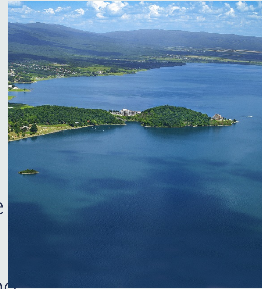
Zemplínska šírava water reservoir