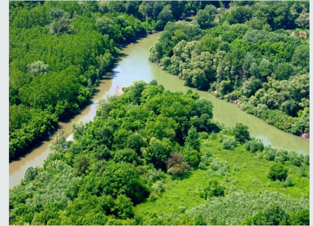
The Laborec flows into the Latorica River