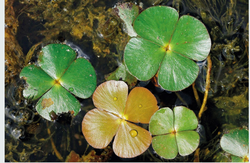
Rare water plant marsilea