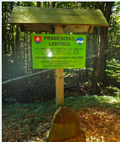
The source of the Laborec