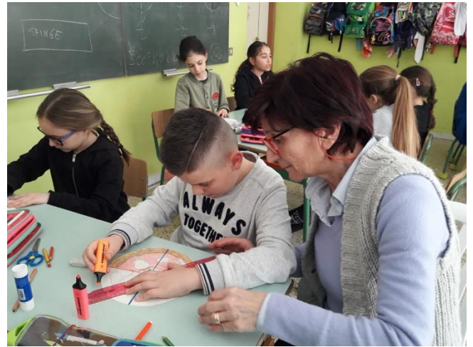
and now divide pizza into 8 parts