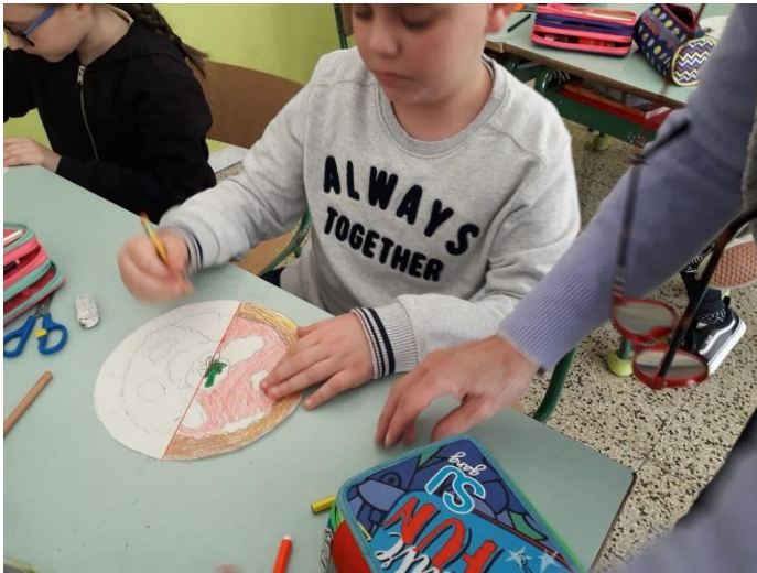
color half pizza