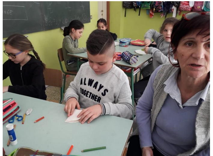
Then fold it in 4 parts