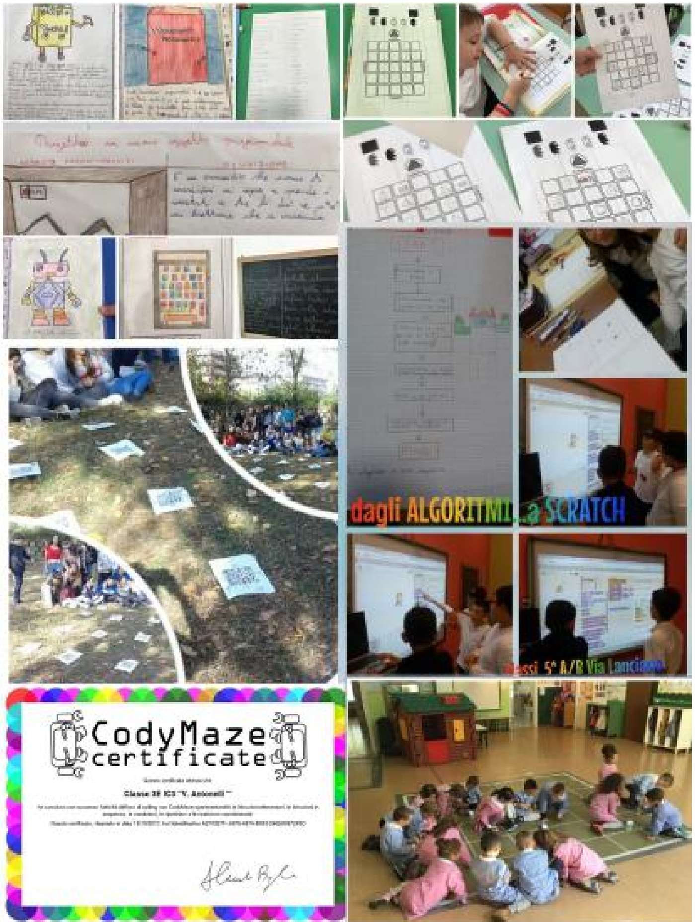
Those are some pictures taken from the “Padlets”