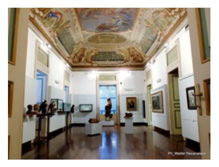
Art gallery Barbella