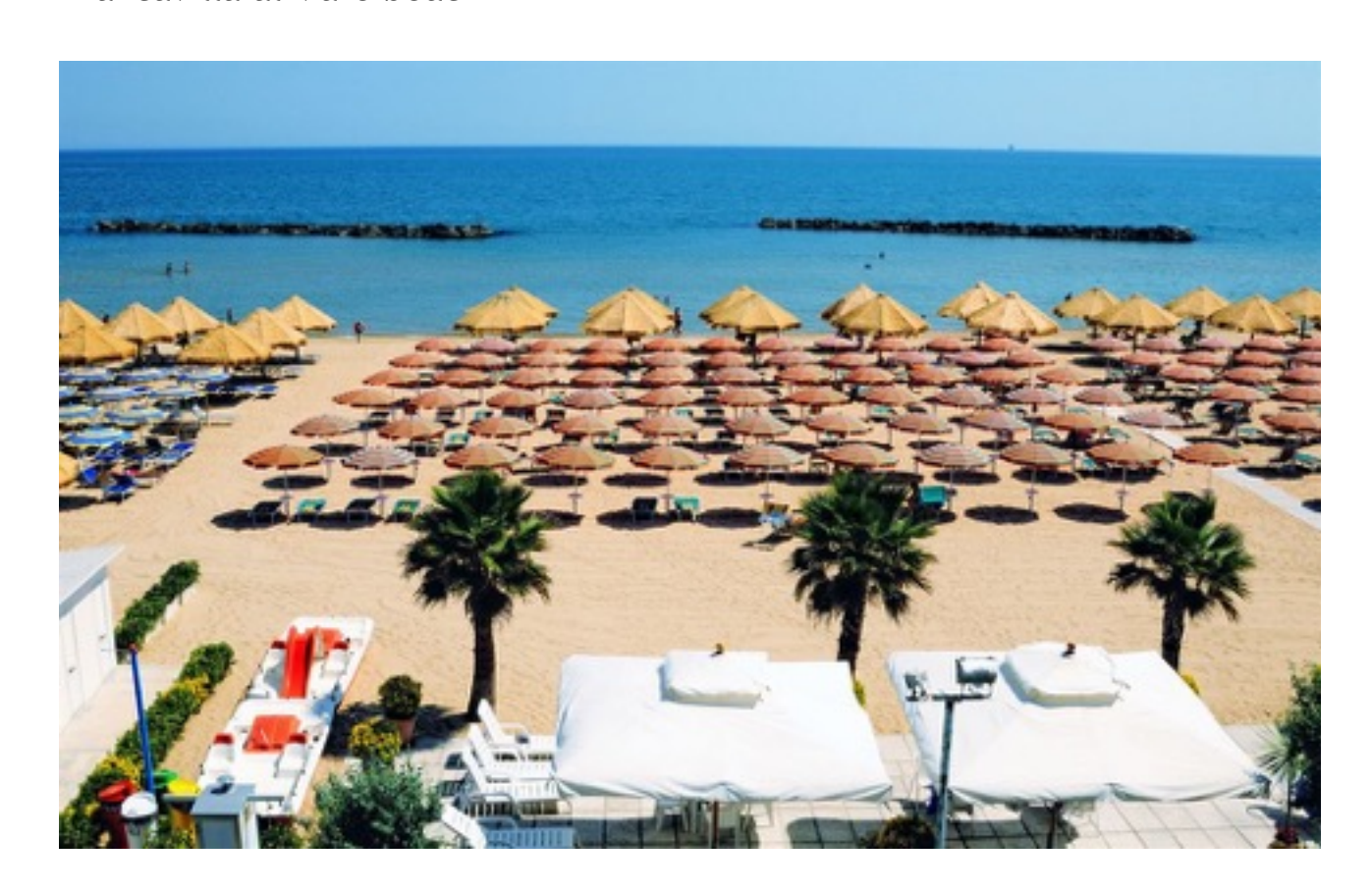
Francavilla al Mare beach