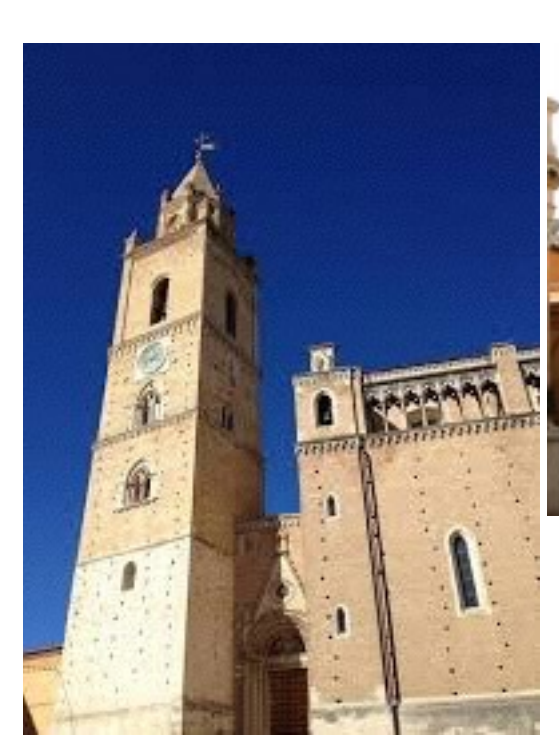
Some shots from the city centre