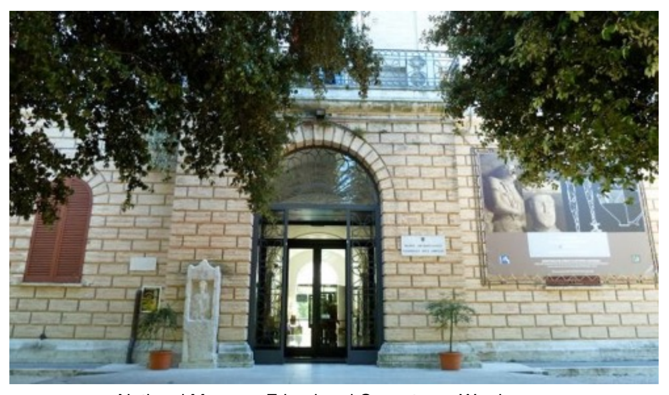
National Museum Frigerj and Capestrano Warrior