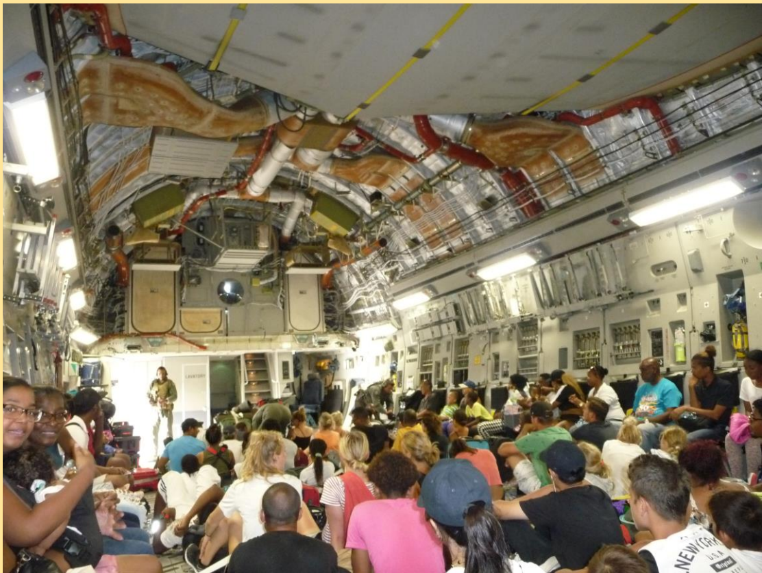
In the plane in Sint Maarten. It was packed with people!