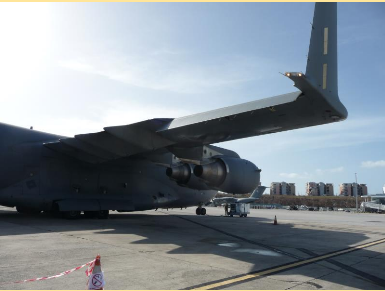
the plane that brought us to Curacao