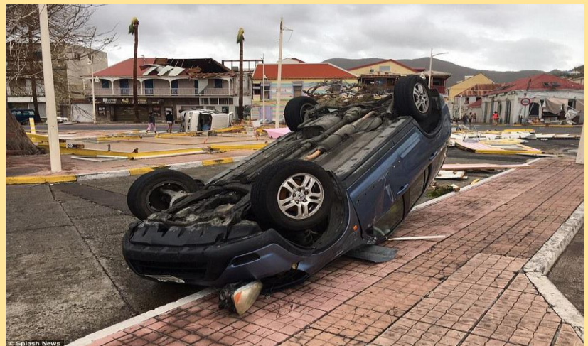
Hurricane Irma “The eye”.