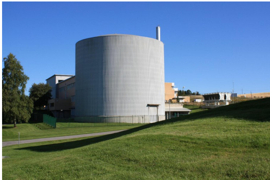
Jeep 2 in Kjeller