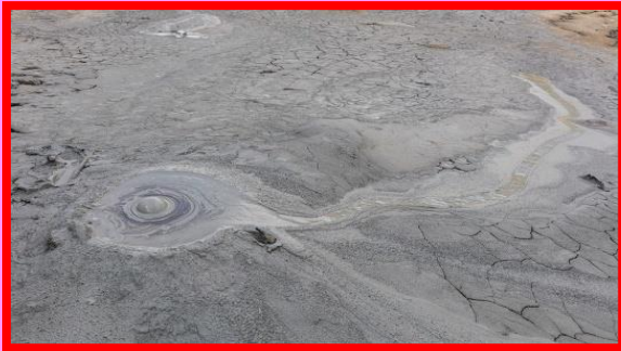
A bubble of gas

The presence of the so-called "muddy volcanos" located in the Buzau county, near the village of Berca is interesting. Not as spectacular as real volcanos, but still an interesting phenomena. These so-called volcanoes are active all the time, which means gas is pushing mud to the surface in a continuous way, but at low speeds.