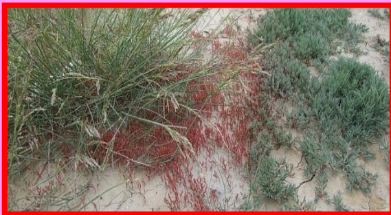
Vegetation at the base of the mud volcanoes

The mud volcanoes create a strange lunar landscape, due to the absence of vegetation around the cones. Vegetation is scarce because the soil is very salty, an environmental condition in which few plants can survive.