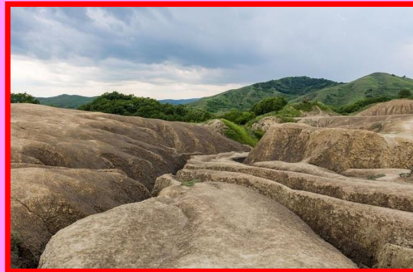
Landscape formed by the mud flows